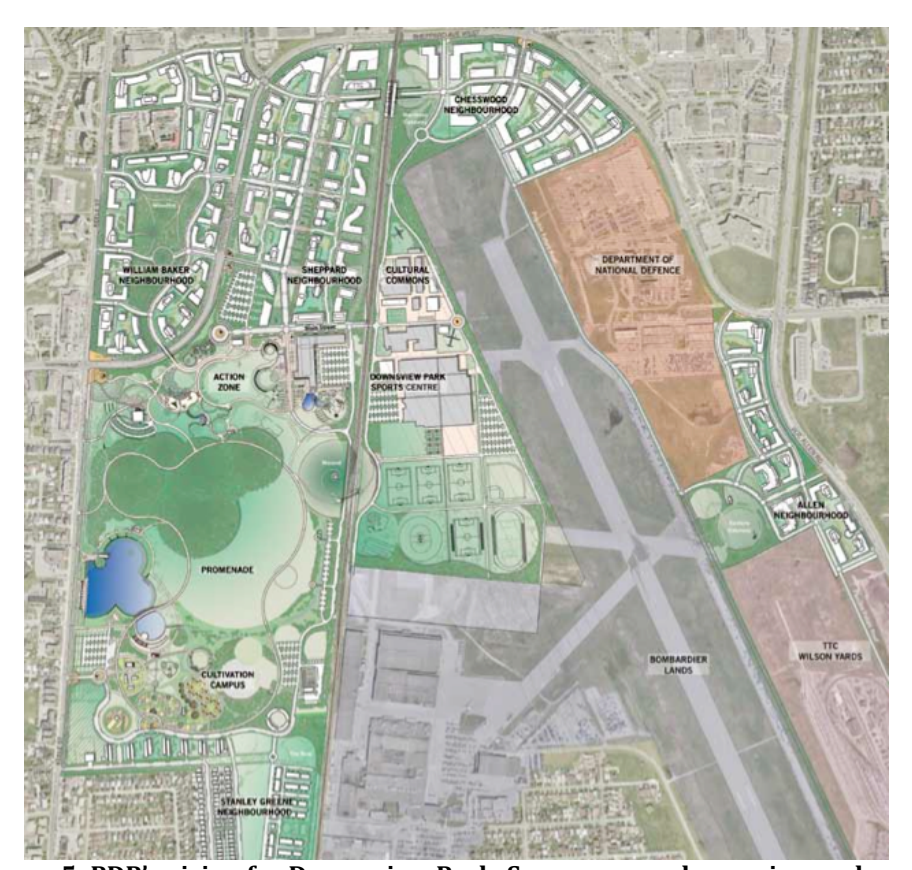
Figure 5: PDP's vision for Downsview Park.

Canada Lands Company installed potted plans that mark an entrance into the park near the intersection of Keele Street and Sheppard Avenue. An amphitheatre was built into the Promenade Zone that overlooks the lake acting as a focal feature for pedestrians and others passing through the Downsview area as well as a gathering space for smaller festivals such as the Canada Day celebrations every July 1 (See Figure 5).