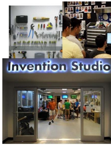
Figure 1: The Invention Studio has significant potential to transform engineering education.

James Madison University Department of Engineering has been developing its maker space since the program's founding in 2008. In order to nurture and promote its design-build-test mentality 8 , the program has developed four general purpose spaces and two studios (freshmen and sophomore studio) with restricted use. All these spaces are staffed with full time lab managers or undergraduate Teaching Assistant (TA), and with the exception of the freshmen studio, they have open hours in the afternoon and evenings.