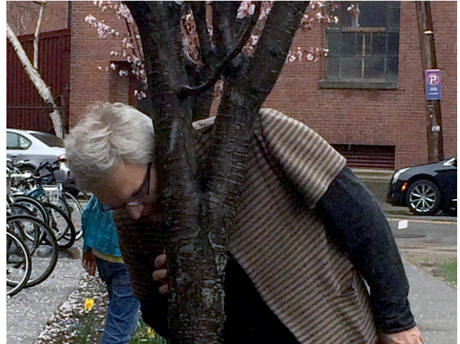
Figure 1: A spectator pays a close ear to the excited tree.

To create this effect, an audio exciter transducer is attached to a tree trunk several inches underground. A nearby solar-powered controller provides computation and wireless network connectivity, and drives multiple transducers independently using underground cables, allowing the whole system to be off-grid. Our approach lets the technology disappear from a user perspective, producing an almost magical effect of sound seeming to emerge from inside the tree itself. We have used the ListenTree in a number of installations with both live and pre-recorded sound. Currently, we plan a number of new, simultaneous installations in museums and