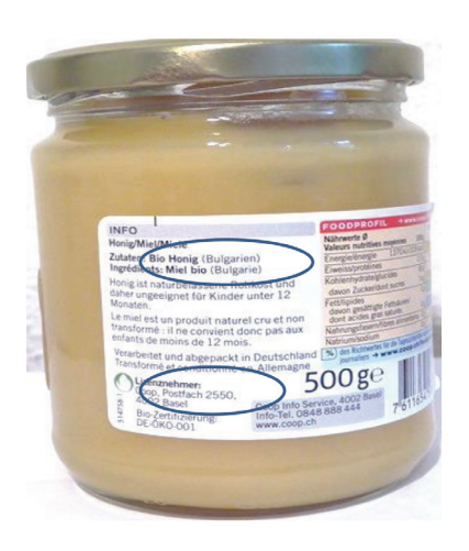
Figure 4. Bulgarian organic honey re-packaged and branded in Germany for export to the EU and Switzerland

This ensures a lower price of Bulgarian products and accounts for the stereotype that they are high-quality and low-priced. In these cases, the role of "the trusted person" is to guarantee the necessary quantities for export by cooperating with other producers or purchasing their produce.