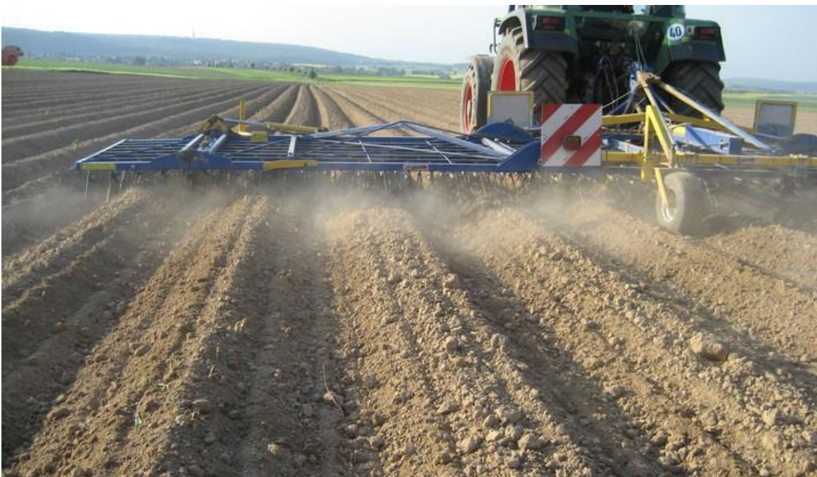
Figure 2: Precision flex tine harrow (Treffler)

In livestock-based arable systems, annual weeds are relatively easy to control by appropriate mowing regimes of the ley. Cutting grass-clover or similar leys usually break the life cycle of annual weeds before they are able to form seeds, determining their decline over the whole crop rotation. On top of this, use of flex tine harrows like the Treffler one would result in improved annual weed control in both the ley and annual crop phases of the rotation (Huiting et al., 2014).