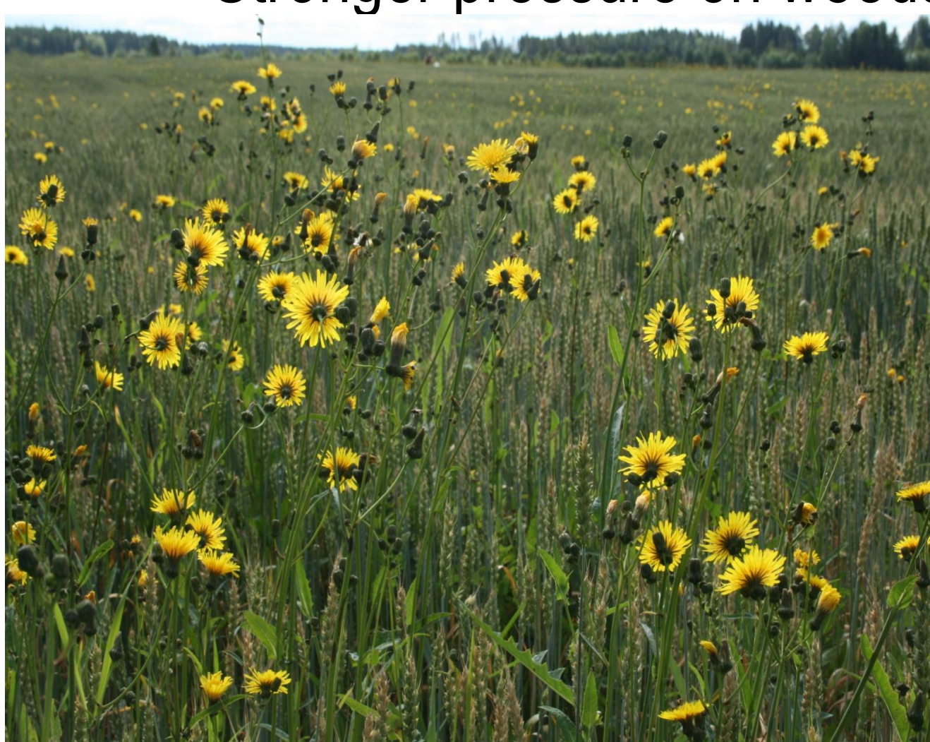
Sonchus arvensis ; a problematic perennial weed.