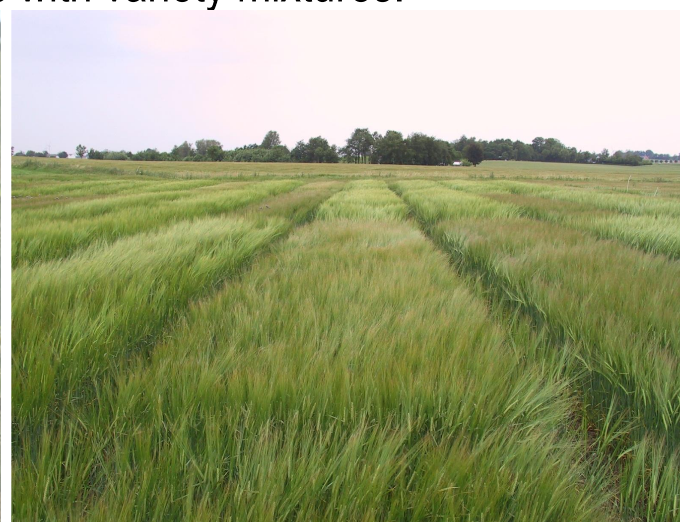
Weed suppressive ability of different spring barley varieties.