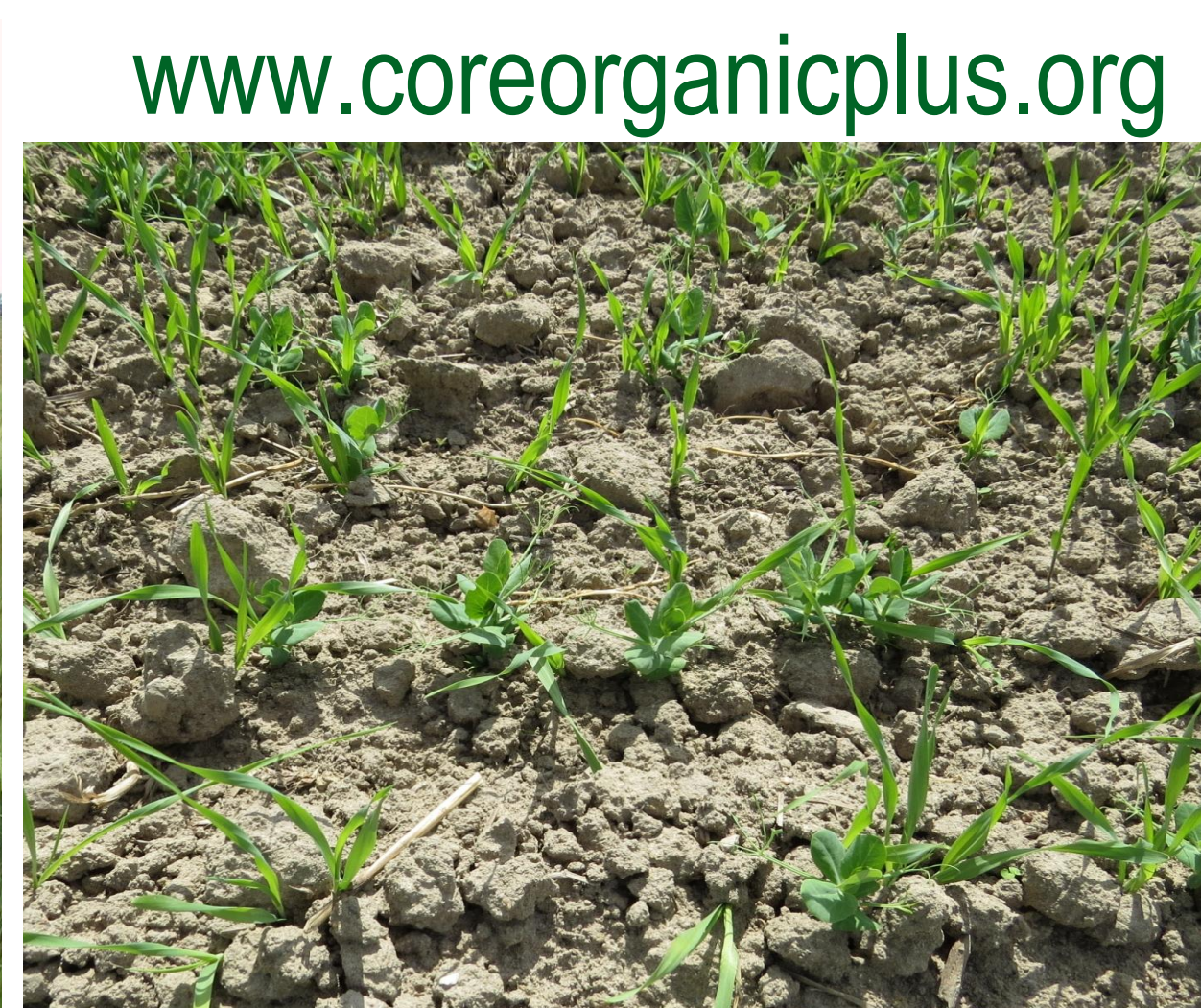
Grain-pea crop mixture.