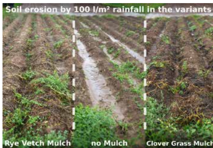
Effects of mulching on late season erosion after defoliation in August 2015.