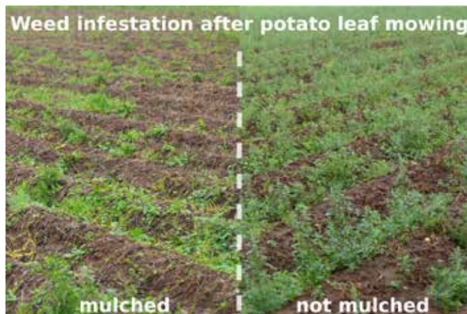
Effects of mulching on weed infestation in early August 2015.