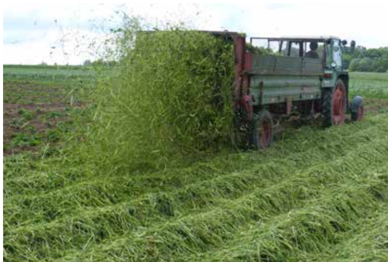
Application of freshly-cut mulch materials in mid-May with a manure spreader to 8-10 cm depth on the potato plots.

The weather conditions in the two years were extremely variable. In 2014, water availability was normal to high in spring, and the summer temperatures were the highest in more than 100 years. In 2015, the spring was very cool and dry with extreme drought in May, followed by normal summer temperatures. This affected the potatoes very differently. In 2014, mulched potatoes were