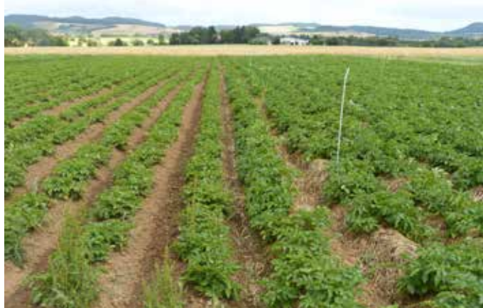
8 July, 2015: Potatoes in the ploughed treatments (left) suffered severe drought but not in the minimum tilled and mulched treatments.