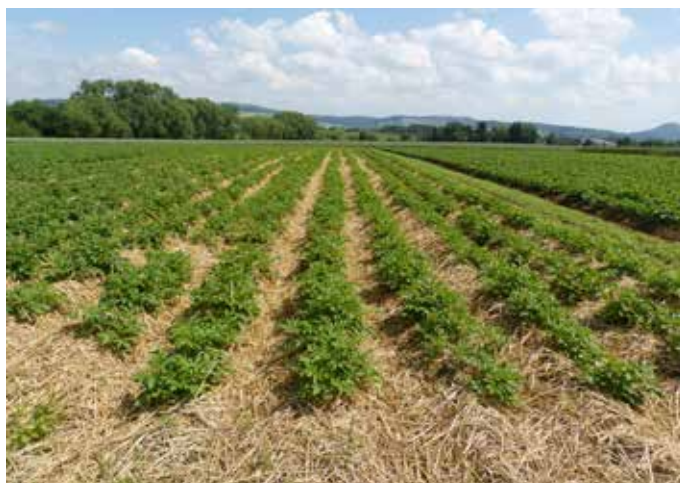
June 6, 2014: the mulched potatoes in the foreground are less lush and green than the ploughed potatoes in the background.