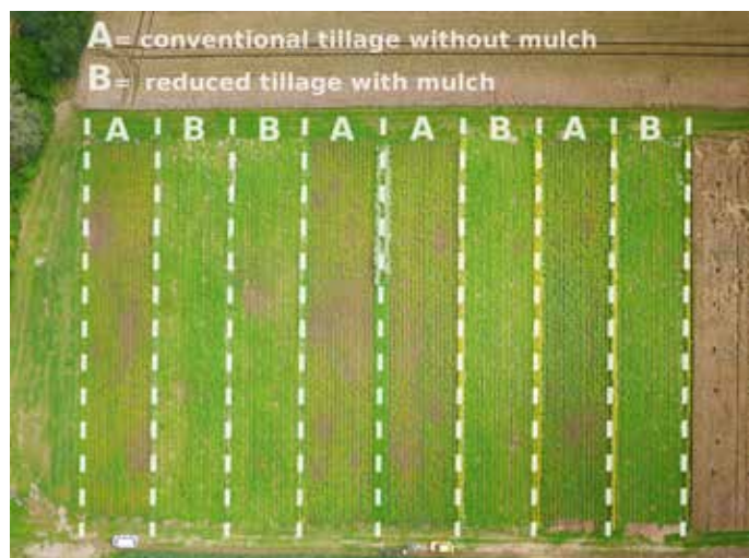
Aerial photo of the plots July 14 2014 during the late blight epidemic.

In 2014, we had a 'normal' late blight epidemic starting in early July. Spread of blight across the mulched treatments was slower by about two weeks, and cumulative disease as expressed in the area under the disease progress curve (AUDPC) was 880 under mulch and 1330 in the ploughed plots (Hohls et al. 2015). The most likely explanation for the reduction of late blight in the mulched plots is that overall the temperatures in the canopy are higher during the day due to the reflection of light by the dried mulch, resulting in a non-conductive microclimate for germination of the late blight sporangia. We could feel the differences in temperature in the field and have measured these in other experiments before, but not in these experiments.