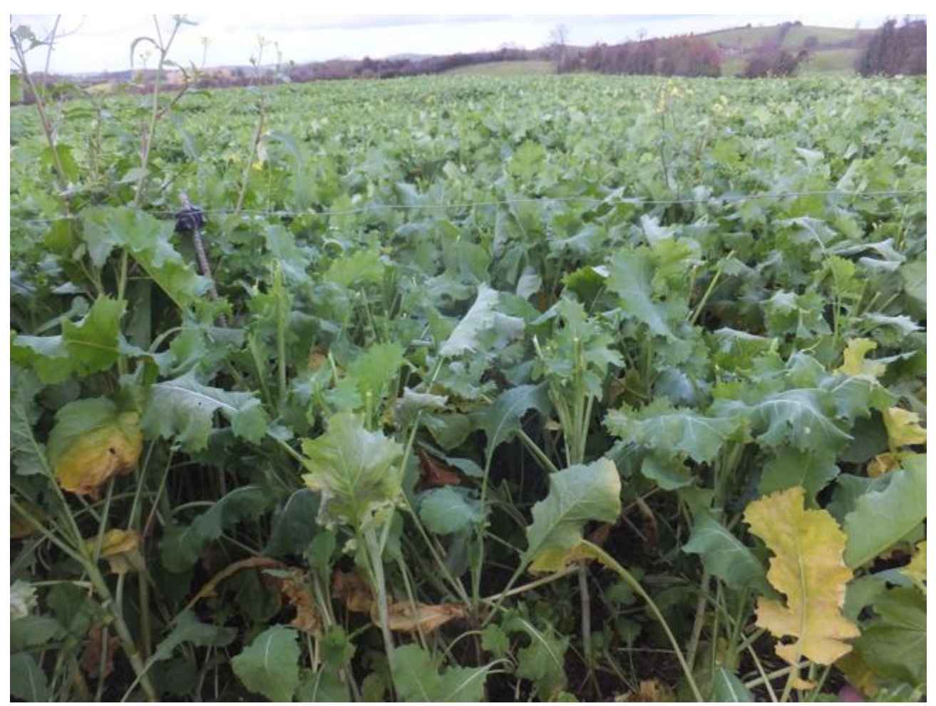
Forage rape/stubble turnip mixture growing on Mark Duffy's organic farm, Ballybay, Co. Monaghan, used for fattening cattle during the winter, prior to slaughter.

Using a higher sowing rate should also help the crop to outcompete weeds. Weed seeds are more likely to germinate in May than June, so sowing kale or swedes early (May) increases weed pressure. June sowing of swedes and kale should reduce if not eliminate the need for weed control. Teagasc research has shown that no weed control should be needed for forage rape.