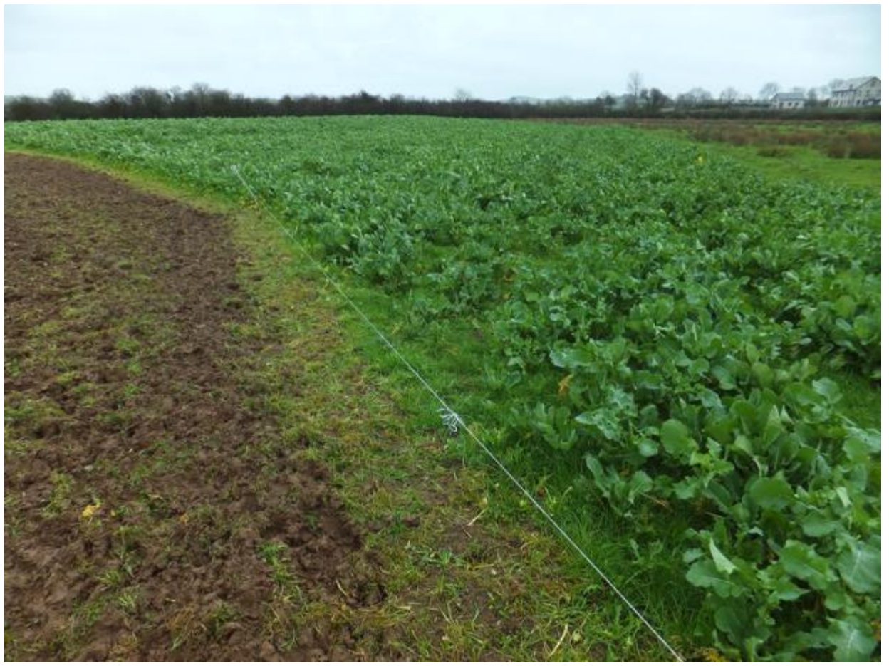
A forage rape/kale/stubble turnip mixture growing on Sean Condon's organic farm, Crecora, Co. Limerick. This rape/kale/stubble turnip mixture was sown on 1<sup>st</sup> August on 2.4ha. Prior to sowing the field was grazed down very tight, shallow ploughed, power harrowed and sowed along with a liming agent using a fertiliser spreader. No other nutrients were applied. The seedbed was then rolled using a Cambridge roller. This forage crop gave very palatable high protein winter grazing for 20 yearling heifers.