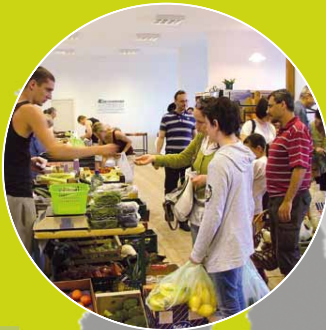
Weekly organic market in Újpest, Budapest.