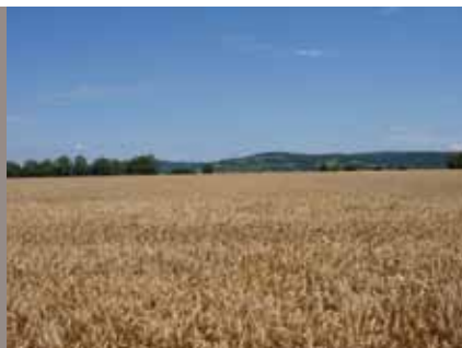
An organic wheat field in western Hungary.

(%) for food characteristics (Fürediné Kovács, A. 2006).