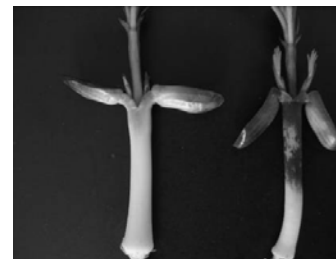
"A" stage "n" stage "M" stage

Fig. 1. The peanut AnM cultivation (left) and color changes (right) after hypocotyl exposing.