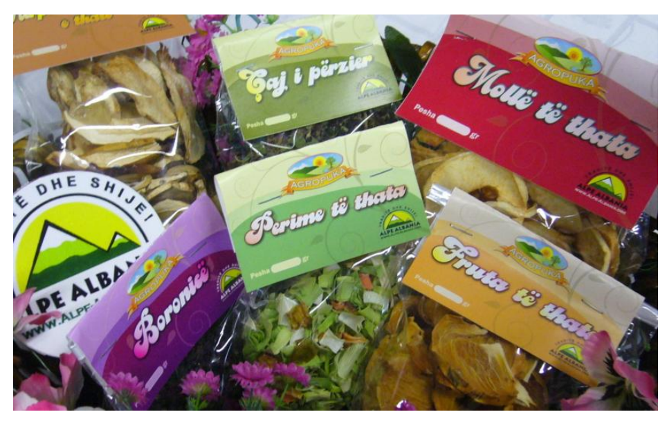
Figure 3. Basket of different dried AgroPuka products

When the AgroPuka project stopped, in 2009, SASA just started its last project phase. This led to the situation that the executive director of AgroPuka got strongly involved in the participatory process that the PMCA Unit set in place to develop new business opportunities for organic and typical food products from Albania. Indeed, in this new project setup of SASA, AgroPuka with its interesting range of processed products (i.e. tried fruits and mushrooms, tea mixtures, honey, and jams) was a key participant in the Thematic Group relating to typical products from Northern Albania. For SASA, the experience of AgroPuka in regard to both production and marketing was highly valuable. And for AgroPuka, SASA's explicit focus on marketing opportunities was highly beneficial. For instance, a key experience for AgroPuka related to one of the focus group research activities implemented in the context of the SASA project, where AgroPuka's honey received absolutely best scores for taste and consistency, but its packaging and labelling was graded worst compared to competing products. This insight motivated AgroPuka to rethink the marketing concepts of its products with the support of SASA's PMCA Unit. Consequently, product packages and labels were upgraded together with a new AgroPuka logo (see Figure 3). All product labels also featured the Alpe Albania logo, which was developed in parallel as an "umbrella brand" for all typical products from Northern Albania (see Table 1).