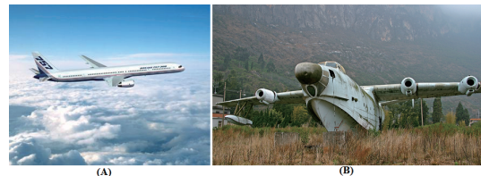
Fig. 1. An example of airplane recognition using MIL: (A) the background of “sky” provides an important context for the recognition of “airplane”, (B) the background of “mountain” is not a useful cue for the recognition of “airplane”

The IMIL methods treat all the instances from a bag as independently and identically distributed (i.i.d.). These methods can be further divided into generative IMIL and discriminative IMIL. Axis-Parallel Rectangles (APR) [1], Diverse Density (DD) [8], Expectation-Maximization (EM) version of Diverse Density (EM-DD) [9], Generalized EM-based Diverse Density (GEM-DD) [10] are all in the generative IMIL category. MIL problems can also be tackled in a discriminative manner by adapting standard supervised learning approaches. The methods of this type learn a classifier that separates positive and negative bags. The work falling in