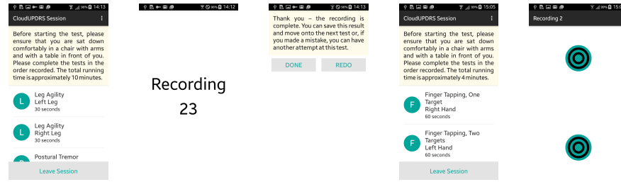
Fig. 1. Views of the user interface of the CloudUPDRS app showing session management, tremor recording and finger tapping activities..

in this paper we present the key contributions of this work towards achieving this goal. Specifically, we describe: