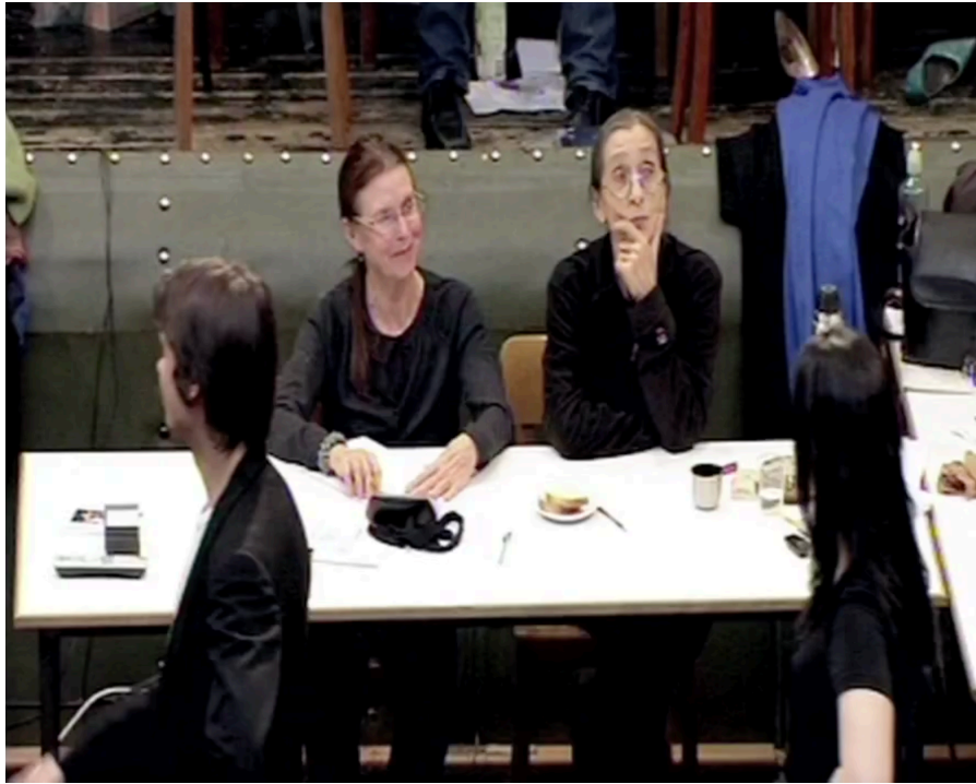
Figure 1. Pina Bausch watching her young dancers parade in a new production of Kontakthof .