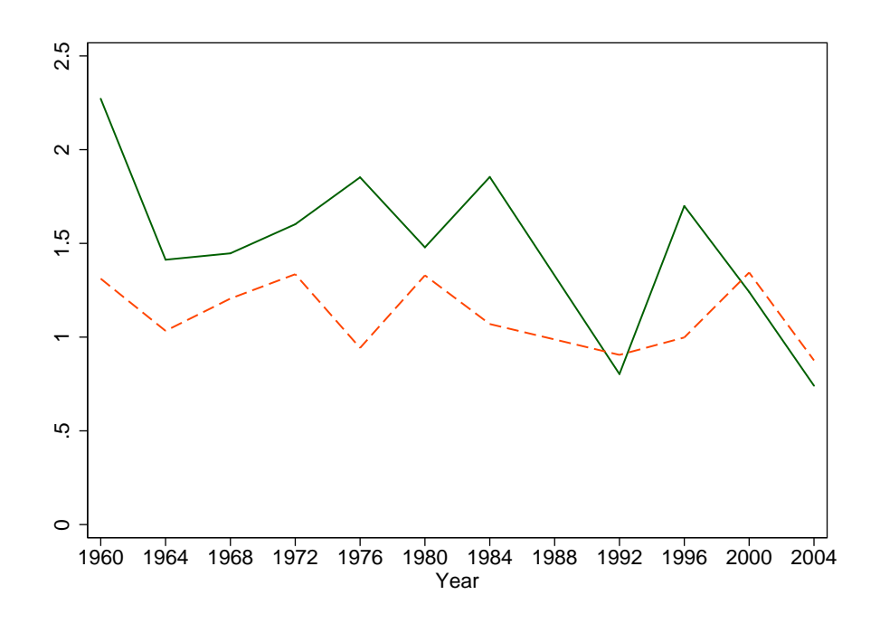
Figure 1: Simulation of the effect at the intensive and extensive margin