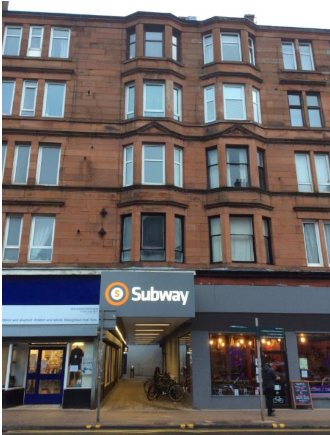
Figure 3 , shows the access passage to Kelvinhall Subway station ticket office and the station through a tenement building, the Subway retaining ownership of the airspace within the tenement block