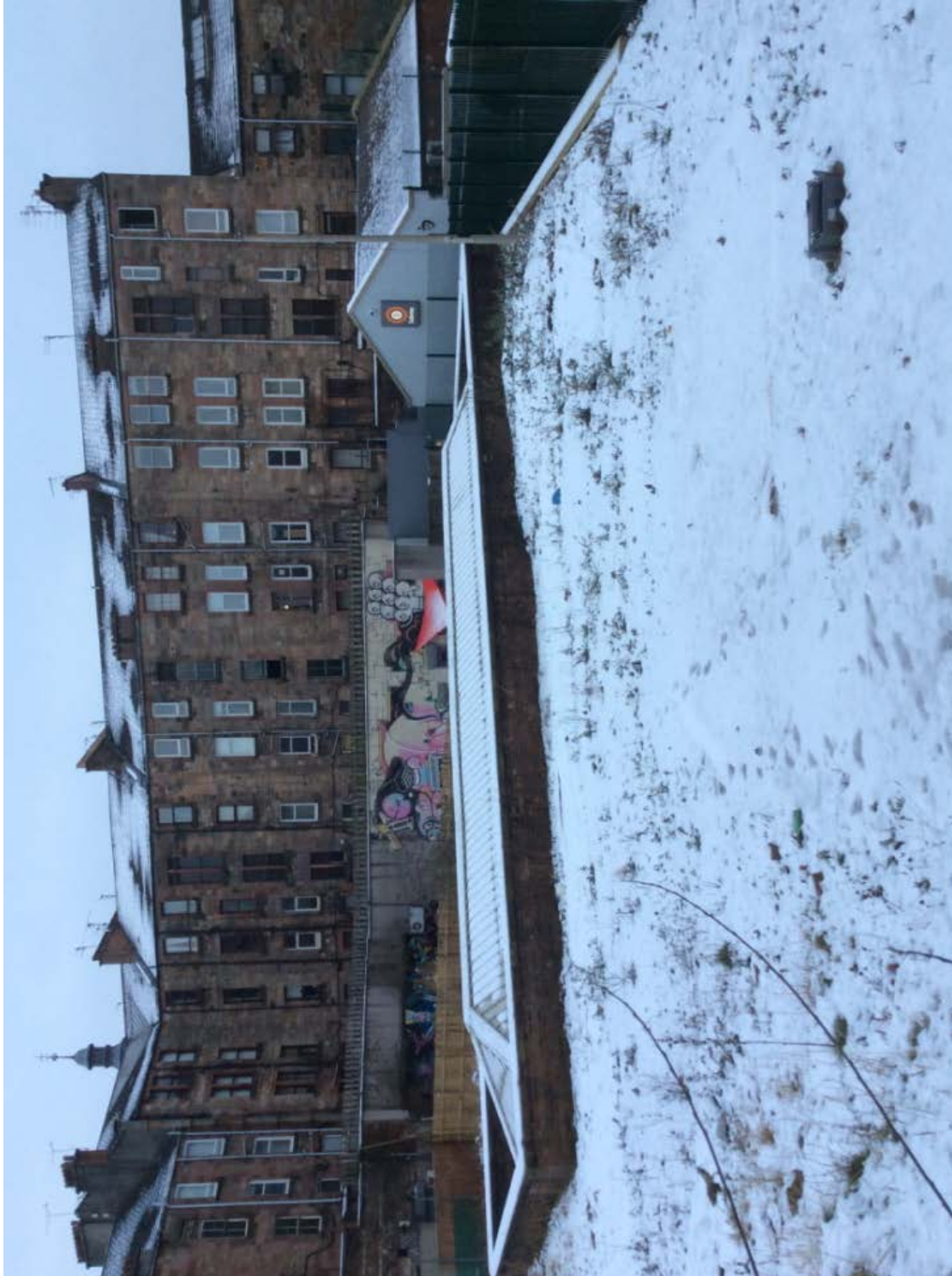
Figure 2 , shows the site of Kelvinhall station on the Glasgow Subway. It is in open cutting with a glass roof, with the surrounding Strathclyde Partnership for Transport (SPT) owned land undeveloped.