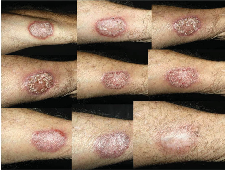
Figure 2. Treatment of chromoblastomycosis from time 0 to 20 months' application of topical imiquimod 5% plus itraconazole 200 mg day -1 [9].

without concurrent oral antifungals, was highly active in promoting the elimination of F. pedrosoi from skin lesions [9]. It is therefore important to understand the virulence properties and immune recognition of the major fungal pathogens in order to inform augmentative immunotherapy options. At present, our understanding of these areas is dominated by investigations of model pathogens such as Candida albicans , and we are not yet able extrapolate this knowledge to be predict how even related Candida species induce pathology.