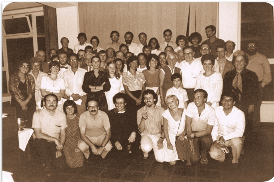
Statistical Extremes and Applications, Vimeiro, 1983.