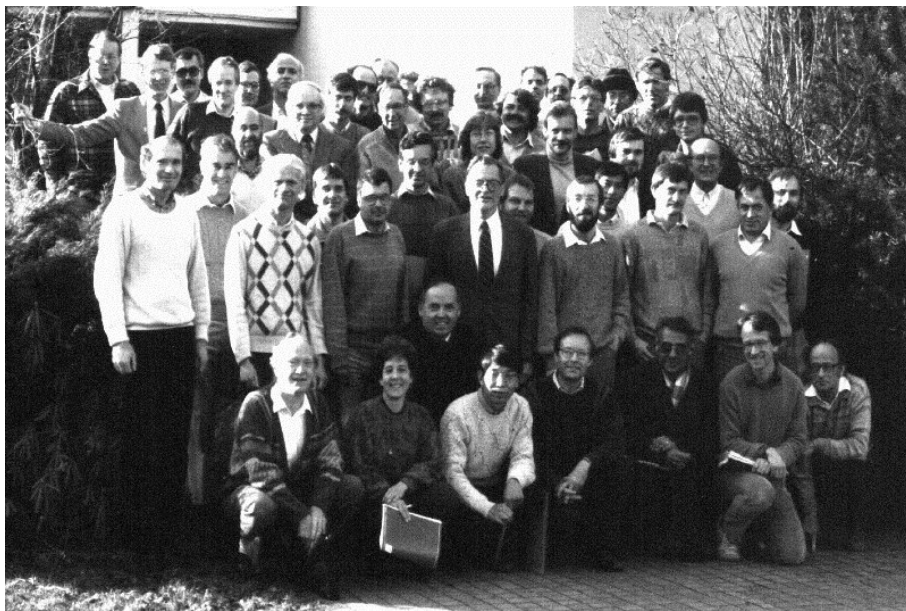
Conference on Extremwerttheorie, Oberwolfach, 1987.