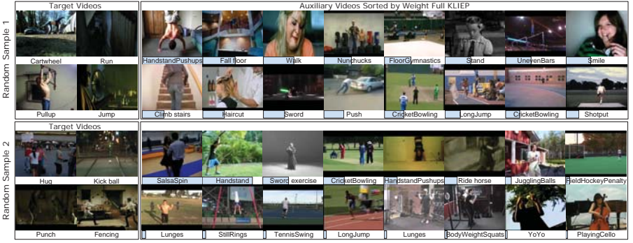
Fig. 2. Visualisation of Full KLIEP auxiliary data weighting. Left: 4 target videos with category names. Right: 16 auxiliary videos with bars indicating the estimated weights.