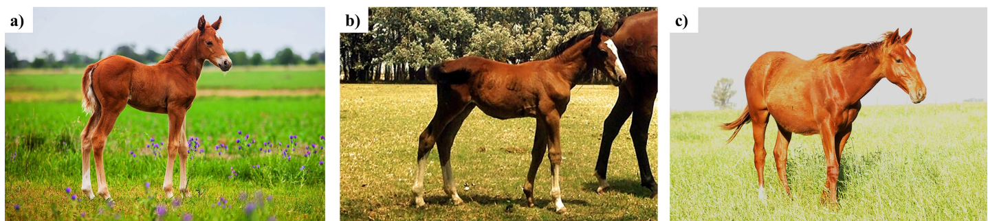
Fig 2. a) Cloned polo pony derived from 1-2h group in experiment 1, born on October 2013, b) Jumping horse cloned derived from 2-3h group in experiment 1, born on November 2014, c) Thoroughbred horse cloned derived from the control group in experiment 2, born on June 2014.

We determined the effects of 3 different time periods (between nuclear transfer and activation), less than 1 h (<1h group), between 1 h and 2 h (1-2h group) and between 2 h and 3 h (2-3h group), on in vitro and in vivo development of horse clones. Blastocyst development rates were analyzed per embryo and per ZFRE. A significant improvement in blastocyst rates was observed as fusion-to-activation time increased, with the best results obtained in the 2-3h group: 11.5%, 5.6% and 5.2% for 2-3h, 1-2h and <1h groups, respectively (Table 1). We next examined the in vivo effects, including pregnancy rates, number of offspring and viable offspring. The results in vivo agreed with those obtained in vitro , obtaining the highest pregnancy rates (9.5%) in the 2-3h group (Table 1) and the lowest one in the <1 h group (2.0%). In this experiment, a total of 24 foals were born, 19 from the 2-3h group, 5 from the 1-2h group and 0 from the <1 h group. Foals viability differed between groups as 2/5 of the born foals died in the 1-2h group compared to 2/19 in the 2-3h group. Those foals died during birth or immediately after birth, mainly as consequence of umbilical abnormalities (enlargement, omphalocele, schistosomes), observing also limb deformities and failure of passive transfer. These abnormalities are commonly observed in cloned foals [6, 38, 39, 40]. By December 2015, the 20 foals from both groups remain healthy (Fig 2A and 2B).