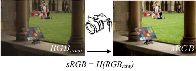
Fig. 2. Color correction (mapping raw to display sRGB) is an homography problem. This figure is also a color chart example which was used for our color correction evaluation.

RGI form between illuminants. Due to different shading, the RGI triple under a second light is represented as \underline{c}'^T = \alpha' \underline{c}^T H , where \alpha' denotes the unknown scaling. Without loss of generality let us interpret \underline{c} as a homogeneous coordinate i.e. assume its third component is 1. Then, [r' \ g']^T = H([r \ g]^T) (chromaticity coordinates are a homography H() apart). ■