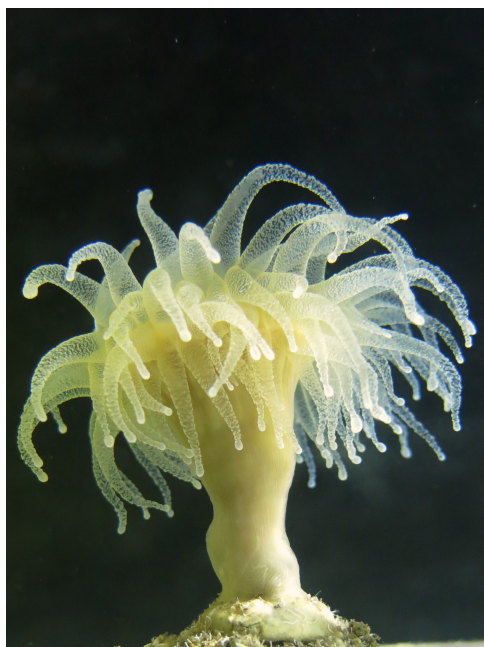
Figure 1 The cold-water coral Desmophyllum dianthus .

reveal whether corals are mainly metabolizing proteins, carbohydrates or lipids, giving a further indication of coral stress under the experimental conditions.