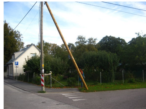
A corner garden in Karlova