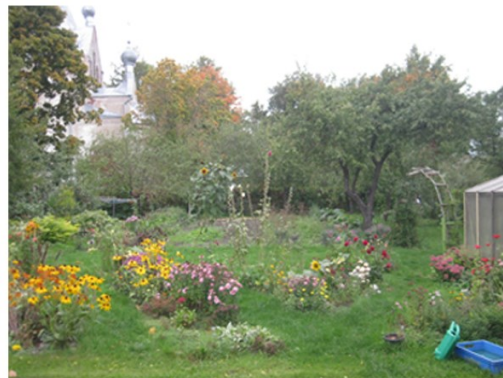
A Rear Garden Space in Karlova