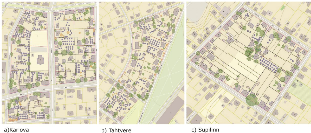
Fig. 3: Sample study areas – maps showing the spatial distribution, green area and tree canopy (drawings not to scale); a) Karlova; b) Tähtvere C) Supilinn

maturity and tree species richness were recorded. The information was mapped and a series of statistical analyses of the relationship of the variables was carried out. Figure 3 shows the distribution of the green elements within each sampled segment.