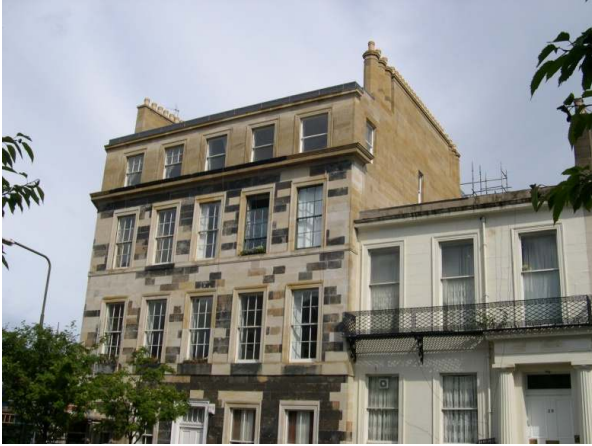
Figure 1. Repairs in Montgomery & Windsor Street, Edinburgh

chitect Jo Parry). The corner tenement is a significant witness of William Playfair's plans for his Eastern New Town Scheme, materialised mostly after his death. The value of the restoration project was about £800,000, which was shared to £30,000 among each owner, a substantial investment. The project carried out the rebuilding of both gables, extensive repairs and stone replacement to the elevations, and roof repairs, including the reinstatement of the octagonal chimney profiles and copes to Playfair's original design allowing the building's original aesthetic integrity to be restored.