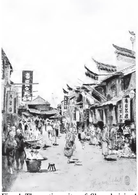
Jersion Fig. 1 The native city of Shanghai in 1907 painted by Thomas Hodgson Liddell

Within a few hundred yards of these modern buildings, constructed according to all the latest ideas of civilisation, we are at once carried back to the conditions prevailing in the Middle Ages in our own country. Plunging into a low, dark, and evil-smelling tunnel, or passage, through the wall, we see the old gates fitted with immense wooden bars for closing them at night. Beggars are everywhere, cripples with grotesque and unusual deformities, and other sufferers. The air is filled with the loud cries of the small huckster announcing the nature of his wares. Quaint little shops line the narrow passages, whose greasy pavement exhales the rich, close, and altogether peculiar odour so familiar to all old residents in the Celestial Empire (emphases mine).