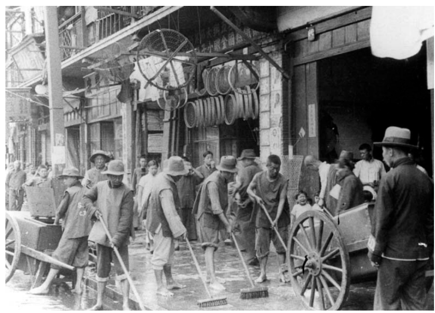
Fig. 2 Cleaning the pavement in Shanghai in ca. 1920

Sweeping the streets was certainly a basic method of removing stench. As early as 1856, in one meeting of the Council, G. Gray, a member of the Council, reported that Mr. Dallas had been entrusted to remit 50 pounds to London in order to buy 'two water baths for watering the roads.' This determination reflects the mentality of the earliest British colonisers: an insistence on purification by means of their own 'technique.' The by-laws of the 1869 Land Regulations contain two articles about cleansing streets, one concerning the public streets (article XVIII) and the other the areas in the front, side or rear of private premises (XXV). To clean the public streets in 1861, for instance, fifty cleaners were at work each day. In the 1870s the Council had at its disposal nearly 100 cleaners, six carriages and several wheelbarrows. Main streets of the Settlement were cleansed twice a day (Fig. 2).