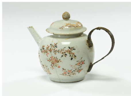
Fig. 2 Chinese porcelain teapot and lid with replacement riveted iron handle (Site Code LHC93, from context 1) from 14 Regent Street.

The well-known precarity of dock labor and maritime work in Victorian London, was one kind of domestic insecurity facing those attempting to make a living in Limehouse (Stedman Jones 1971). The livelihoods of others required them to leave Limehouse on ships that took them away from London's East End for months at a time. The city's working-class sailors were globally mobile as they washed back and forth from dockside neighborhoods on the tides of imperial trade. To such maritime households, the relative security of a seaman's wage was tempered by the long periods of absence and uncertainty that disrupted domestic relationships and led to emotional upheavals. Contained within the privies of 14 and 16 Regent Street were two