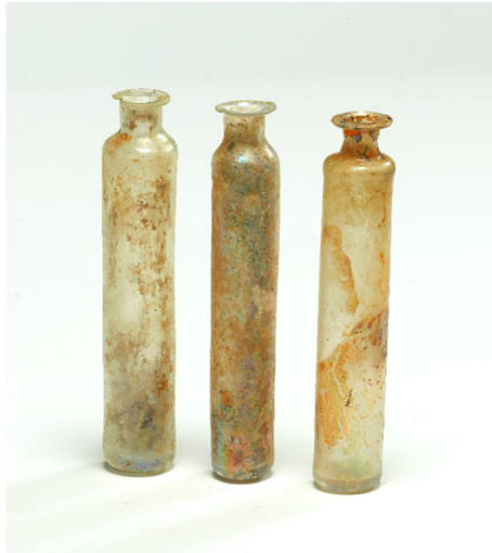
Fig. 5 Glass pharmaceutical phials from 14 Regent Street, Limehouse (Site Code LHC93, MOLA Accession Numbers: 98, 99 and 100, from context [1]).

cutlery marks attest to heavy use. Although plates are generally uncommon, both privies contained a few examples of each decorated with the blue Willow pattern transfer-print, a design that featured on much of the crockery that Londoner's ate their meals off (Jeffries et al. 2009, pp. 335–336; Owens et al. 2010a). Little further diversity in settings is otherwise displayed with the plain refined whiteware oval serving dish, eggcup and pepper caster and blue-transfer-printed mustard pot lid supplying the only “specialist” ceramic tablewares acquired by both households (see Praetzellis and Praetzellis 2009, p. 353, for discussion of specialist tablewares in San Francisco's maritime community). Mismatched both in terms of aesthetic quality but also in relation to when they were acquired, this range of dining crockery represents either part of the stock of equipment supplied by a landlord or that which had been accumulated and left behind as tenants moved on. Practical and functional considerations appear to have overtaken any emulation of middle-class table settings (whether desired or not). Quickly taken meals appeared more important and as discussed by Webster (1999, p. 71), a preference for bowls over plates has been observed in other nineteenth-century settings and interpreted as “reflecting local dietary preferences and eating arrangements” in households that otherwise lacked tables and chairs to allow for formalized dining.