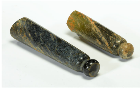
Fig. 3 Ornamental glass rolling pins recovered from 14 to 16 Regent Street, Limehouse (Site Code LHC93, Museum of London Accession Numbers: 107 and 116, from contexts 1 and 5, respectively).

within poor neighborhoods. As already noted evidence from Limehouse suggests that there was a high turnover of residents on Regent Street. Robert Heelis (Medical Officer of Health for Limehouse) commented that the neighborhood’s laboring classes were “very migratory” and that they “remove their residences ... frequently” (House of Commons Parliamentary Papers 1840, p. 24). Understanding why people move is more difficult, but studies of residential mobility suggest issues such as labor market insecurity discussed above and changing family dynamics were important. Frequent moves can be interpreted as an economic strategy, a process of “up-sizing” and “down-sizing” as individual and family fortunes waxed and waned. The season, the weather, the amount of daylight, patterns of trade and war alongside longer term cyclical economic trends, were all factors influencing employment opportunities (Stedman Jones 1971, pp. 118–125). It is plausible that frequent moves in this neighborhood might have been response to these uncertainties as well as to other events that could dramatically shape the well-being of poorer families – accidents, illness, sudden death, or, as just noted, the departure of individuals travelling overseas. As Stedman Jones (1971, pp. 79–80) also argues, casual labor itself was very mobile with workers moving from one casual trade to another in order to maintain an income.