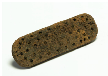
Fig. 4 Wooden scrubbing brush (oak) from 14 Regent Street, Limehouse (Site Code LHC93, Museum of London Accession Number: 10, from context 1).

Nowhere is this more apparent than in the evidence of tableware settings and the insights they offer about mealtimes. In all three privies the numerous ceramic yellowware “London-shape” rounded bowls and more mismatched refined whitewares with either mocha, banded and cat’s eyes industrial slip decoration applied (Sussman 1997; these last vessels can be dated to the earlier nineteenth century), represent the principal means by which foods were eaten, suggesting that economical one pot meals, such as soups, stews and porridges were important. Table cutlery – an uncommon constituent in the rubbish discarded in London’s abandoned privies – is also present and includes five worn lead nickel plated dining and serving spoons used by the occupants of number 14 Regent Street. The few plates located in both the privies of 14 and 15 Regent Street are individual and mismatched, with the most complete – two whiteware plates with even-scalloped blue shell-edge decoration on the rims (Miller et al. 2000, p. 3, Fig. 5) from 14 Regent Street – being at least 20 years old when discarded. Frequent