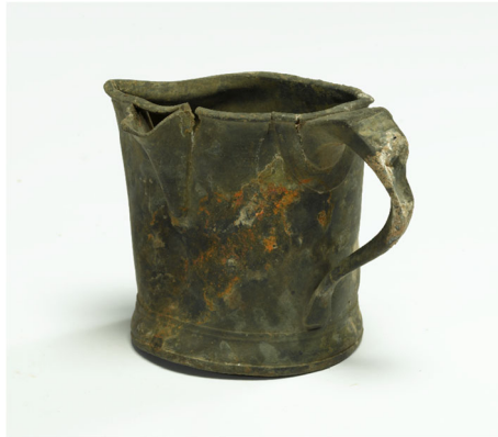
Fig. 6 Pewter quart measure from 14 Regent Street, Limehouse (Site Code LHC93, Museum of London Accession Number: 25, from context 1).