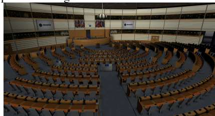
Figure 1: Virtual European Parliament Assembly Chamber

Designing navigation systems intended for multiple users within complex virtual spaces is not a trivial task. The presented system has been developed for such a case, as part of the EC 7 th Framework REVERIE project: REal and Virtual Engagement in Realistic Immersive Environments [1]. The navigation system has been implemented in a REVERIE use case scenario aimed at, but not limited to, the educational sector [2]. Real-world teachers and students can engage as a social group in a virtual educational field trip to a place of cultural significance. The teacher and students are embodied as avatars in a virtual version of the European Parliament Assembly Chamber in Brussels (See Figure 1). Similar to a real-world tour with a personal tour guide, the virtual tour is hosted by a knowledgeable tour guide: a software-driven intelligent virtual autonomous agent. The goal in the presented navigation system is to allow for a mixture of types of movement. This includes via a group of avatars following a leading agent, plus some degree of individual freedom of movement.