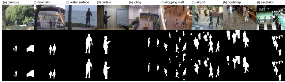
Fig. 1: i2R [22] and WallFlower [21] results: top row is the original image, second row is the ground truth, the third row is our unrefined results with no post-processing. We used the same frames as [24], [13], [25], [26], [27], and [28], for qualitative comparison.