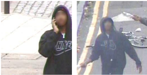
Figure 2: Motivating example. Cropped frames from a CCTV camera capture images of a man wearing a Nike hoodie (left) and later in the video having turned the hoodie inside-out, showing the Nike logo in reverse.

CCTV camera that demonstrates the need of reflection invariance in analysing CCTV images. A man wearing a hoodie exhibiting a Nike sportswear logo is later captured wearing the hoodie inside-out, with the Nike logo in reverse. Consistency in the detected position of a keypoint between an image and its horizontal reflection is important to enable a reflection invariant descriptor such as MIFT ([9]) to be extracted from the same point in the logo to maximise the potential to achieve a correspondence.