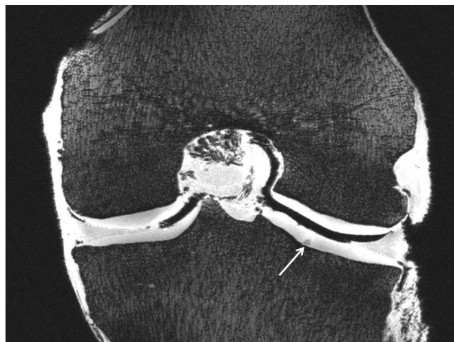
Fig. 1. MRI of human knee joint showing evidence of a HDMP (white arrow).

Results: HDMPs could be detected with several scanning MRI modalities, but the optimum contrast between HDMP and HAC was observed using dual echo steady state (DESS) sequence at 0.23 mm resolution. We found MRI evidence of HDMPs in 6/6 cadaveric hip samples 2/3 cadaveric knee joint samples and 2/3 osteoarthritis hip samples. HDMPs appear as focal regions of hypointensity within the high signal HAC. This is the first report of HDMPs in human knee joints. In one of the OA hip samples the presence of HDMPs was confirmed by X-ray microtomography.