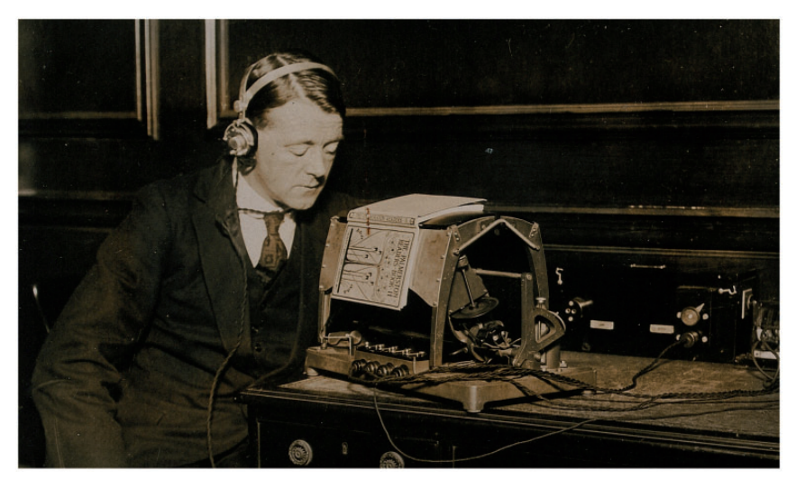
Figure 2 A blind man reading a book using the Optophone. Wellcome Library, London.

presented an opportunity to remake the book for the ears instead of the eyes. Still, veterans had to wait more than a decade after the War for a technological alternative to reading aloud. Before the 1930s, records were unsuitable for books since they could only play for a few minutes; the LP record was not ready for the commercial market until 1948.<sup>23</sup> Blind people benefitted from the technology much earlier, however, when the NIB and St. Dunstan's, working with record labels such as the Gramophone Company (later HMV), succeeded in making discs capable of playing at the reduced speed of 24 revolutions per minute (rpm) for up to 25 minutes per side.