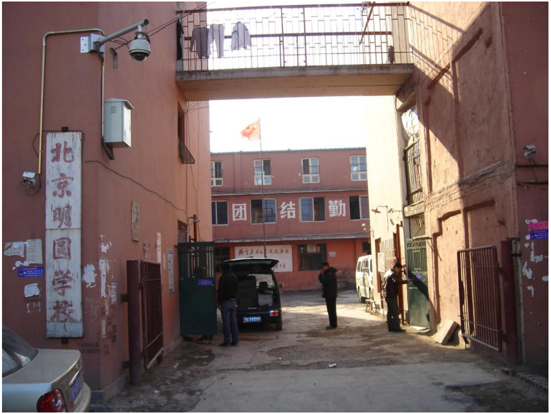
The school gate