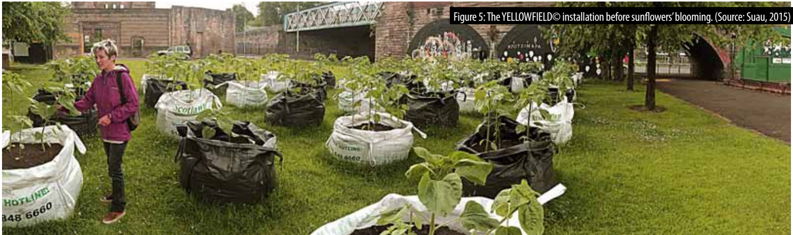
Figure 5: The YELLOWFIELD© installation before sunflowers' blooming.