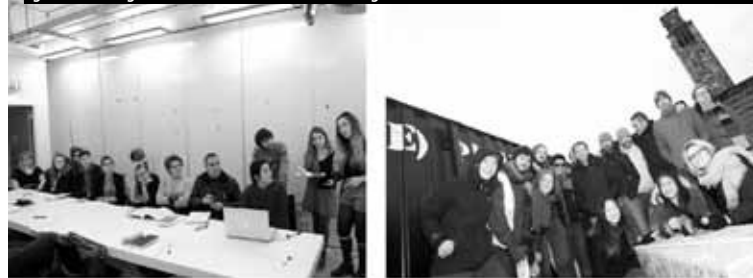
Figure 2: Presentation of design solutions (top images) and outer panorama of the MOBILELAND© garden during weekend activities (bottom image).

8 Radical Architecture (RA), AB964 & AB965 Design Studies 5A: Department of Architecture, University of Strathclyde. This design unit was led by Dr. Suau (design unit tutor/reviewer). Refer to RA website/blog (student design process; unit description; lectures; presentations; and literature reviews): https://strathradicalarchitecture.wordpress.com/ and RA exhibition book: http://issuu.com/cristiansuau/docs/ra_exhibition_booklet_a4 (Accessed on 15 September 2015).