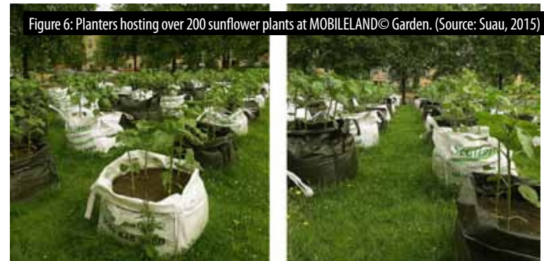
Figure 6: Planters hosting over 200 sunflower plants at MOBILELAND© Garden.

How can we create sustainable edible landscapes? What is Sitopia ? In ancient Greek, sitos means wheat; food and topos means place. The construction of an eco-polis it is possible if we embrace both formal and informal