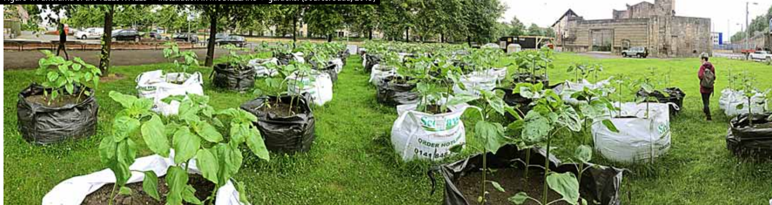
Figure 4: Panorama of the YELLOWFIELD© installation in MOBILELAND© gardens.

The YELLOWFIELD© project demonstrated how ecologically driven activity can be woven into existing urban environments and will hopefully instigate the start of more productive landscapes around the city (Figure 5) (URBAN REALM, 2015). Generally the key activities for future interventions are as follows: