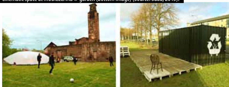
Figure 3: Outer view of the inflatable cinema (top image) and inner view of the cinematic space at MOBILELAND© garden (bottom image) (Source: Suau, 2015).