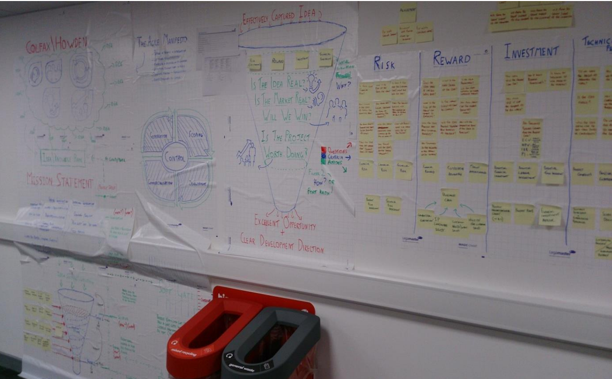
Figure 2 - The expanded visual process map

Within the context of the KTP project, the development of a bespoke NPD procedure for Howden followed an extensive literature review and interviews with stakeholders within the company to identify what NPD processes already existed. Armed with this information the KTP associate employed the visual methodology to create the first iteration of the NPD procedure. Like the methods of visual thinking that were described above, the visual methodology utilised a visual language that would make it easier for stakeholders to comprehend and process the information that the drawing was communicating. Evidence of this is the fact that only three colours were used to draw the image and each colour was used for a specific purpose. Blue was used to describe actions, green was used to provide the rationale for the actions and red was used for describing the review points that would be built into the process. Metaphor was also used within the visual methodology to reinforce the types of actions that were happening within the procedure. For example, the cloud metaphor was used as the drawing for the first part of the process the funnel metaphor is used when describing the sorting and screening of ideas. The visualisation of these metaphors makes it very easy for stakeholders to understand what is happening at each stage in the process. The following comment was made by a Howden employee. "Funnels are popping up everywhere. Every process within Howden at the minute