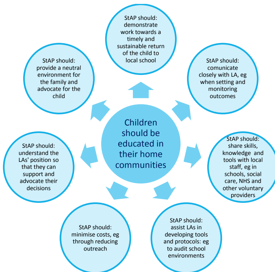
Figure 3: What local authorities want from the project

This position (ie children should be educated in their home communities whenever possible), structures and determines which factors local authorities want to see reflected by the work of the project; some of these are shown in Figure 3: