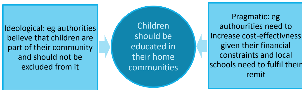
Figure 2: Local authorities' pragmatic and ideological drivers for why children should be educated in their home communities

This position (ie children should be educated in their home communities whenever possible), structures and determines which factors local authorities want to see reflected by the work of the project; some of these are shown in Figure 3: