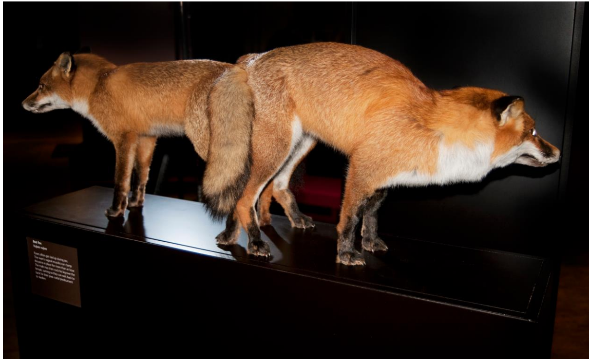
Fig. One: Red foxes locked together during mating.

The first section you come to asks ‘What is sex?’ 2 A sign marked ‘Sexual Healing’ acknowledges there is no single explanation for the evolution of sex in the first place, and that ‘scientists continue to puzzle over how it became so widespread and influential’. Large black and white soft-focus photos of animals in flagrante – butterflies, dolphins, deer - hang along the walls. Around a corner, several spectacular taxidermy mounts are displayed: an adult stag deer, and several pairs of animals mating (Fig1). There are displays on the shape of vaginal canals, sperm plugs, and males fighting for female partners, in an area titled ‘Sex and Violence’. You can sniff tubes of pheromones, listen to mating calls, and see Isabella Rosselini describe the sex lives of various animals – whilst dressed as them – on video displays. The sound of Rosselini mimicking an orgasmic something-or-other carries throughout the hall. 3