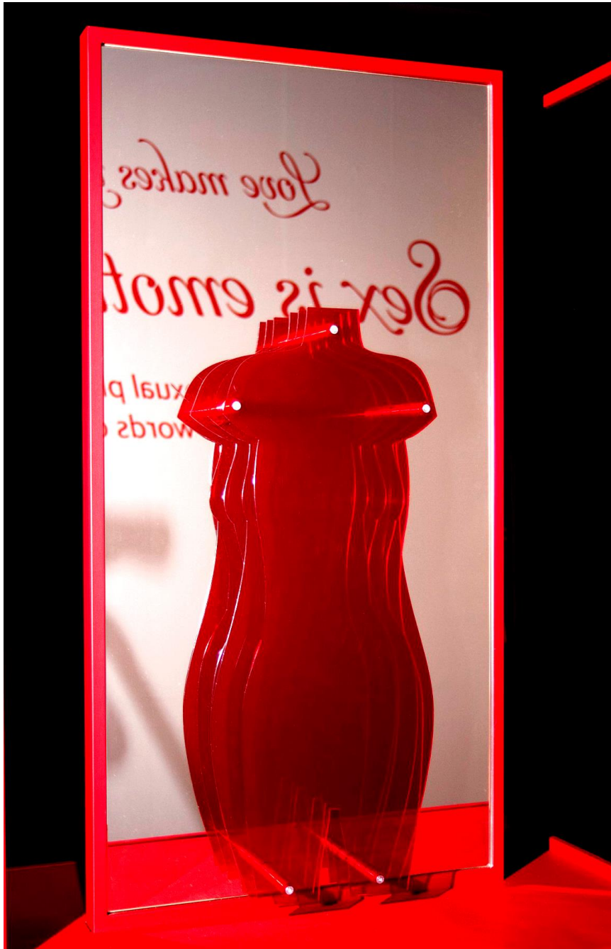
Fig. 4: Human bodies in Sexual Nature .

of abstracted outlines of human bodies, referencing evolutionary psychology research on human attraction (Fig 4). While human tropes continually framed the animal exhibits, this section contained no references to animals, and focused exclusively on human emotions, morals and cultures. The majority of objects on display were cultural artefacts signifying desire, attraction and relationships. These objects presented a largely heteronormative and commercialised picture of human sexuality, with the use of artefacts such as rings, shoes, blindfolds, a framed photo of a male-female couple, and mock-ups of personal ads, again drawing upon and constructing ideas about class, taste and sexuality.