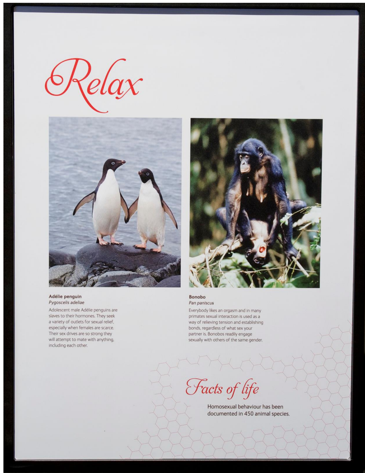
Fig. 3: Homosexuality in the animal kingdom.

Human sex and sexuality was addressed in the final section of the exhibition, which was reached by turning a corner and moving away from the animals displayed earlier. While the exhibition presented the flesh and bodies of animals as spectacle, detailing the unusual shapes of animal genitalia and orifices, there were no human equivalents to the dramatically embodied presentations of animal sex displayed. Instead, the human section contained non-sexual portraits of people (Fig. 2), and a series