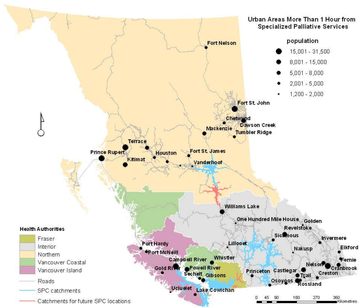
Figure 3 Urban Areas outside of the one-hour SPC catchments. Fifty communities of varying size are more than one hour from SPC services. The largest communities considered to be out of service range are Campbell River, Cranbrook, Prince Rupert, Terrace, and Fort St. John.

ies greatly by health authority as illustrated in Table 1 and Figure 2. The NHA has the lowest population base, but it is spread over the largest geographic area. With just two SPC locations, well over half of its population do not have reasonable spatial access to such care. The situation in the IHA is similar with just over half of its population enjoying access to SPC. Most of the residents in the VCHA and FHA are within an hour drive to one or more SPC sites. Relatively good spatial access to SPC in these two heavily populated health authorities skews the overall rate to make it appear that access is reasonably good for the province as a whole.