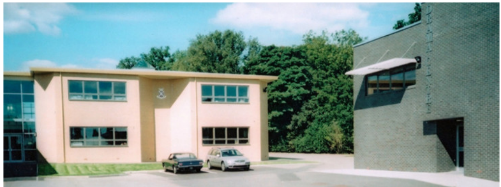
Maths Block and Drama Centre, Parmiter's School

As the drawing above shows, David was able to slice off the corners of the building and configure recesses to achieve a coherent, continuous perimeter form creating striking shadows, highlighted in the photograph below. The shallow roof pitch together with triangular eaves add to the casting of interesting shadow formations. The 45 degree, elegant pyramid rooflight is visible too. On David's recommendation, staff positioned the school crest in the focal recess. The image below shows the Maths block perpendicular to the Drama Centre and their juxtaposition demonstrates the contrasting colour bricks.