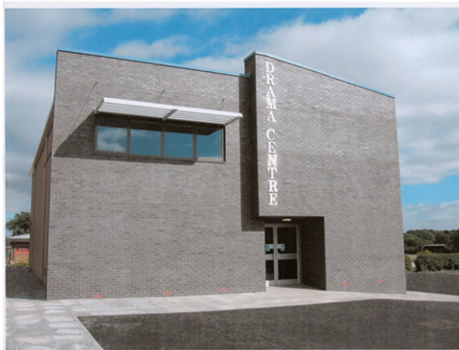
Drama Centre, Parmiter's School