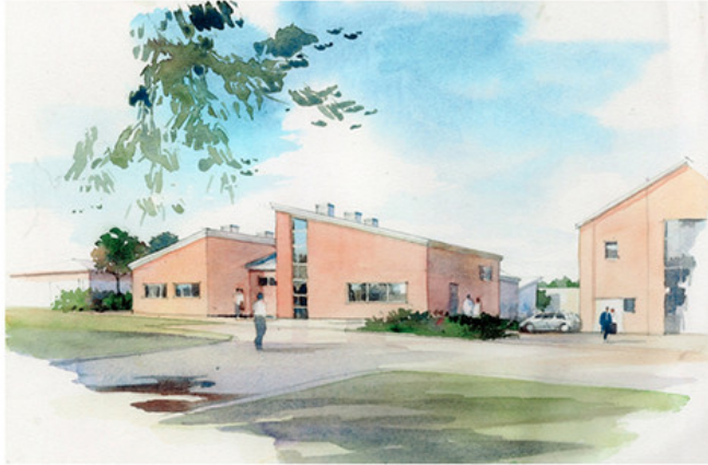
Music Centre, Parmiter's School

Having been involved in a number of projects across the primary and secondary age-phases, the focus here is on the five buildings David designed, while at ACP, for Parmiter's School, a co-educational state comprehensive in Garston. The first project in 2004 was the Modern Language Department with six sound-proof classrooms to prevent noise transference. This was followed by the Music Centre with a recital room, the walls of which have an acoustic quilt to absorb sound, achieving a level of acoustics suitable for small concerts. Below is an artist's impression of the Music Centre.