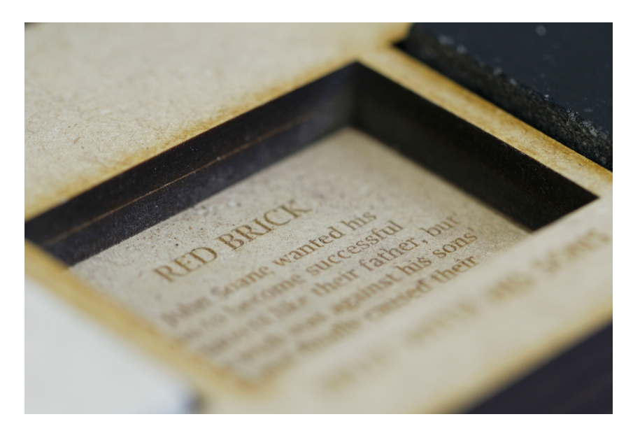
Figure 02. A story revealed beneath a piece of brick, 2014

The piece uses materials relevant to different periods of Sir John Soane's life, as follows: