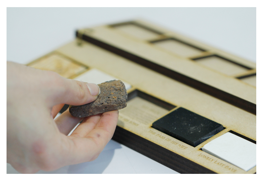
Figure 01. A visitor holding a piece of brick, 2014