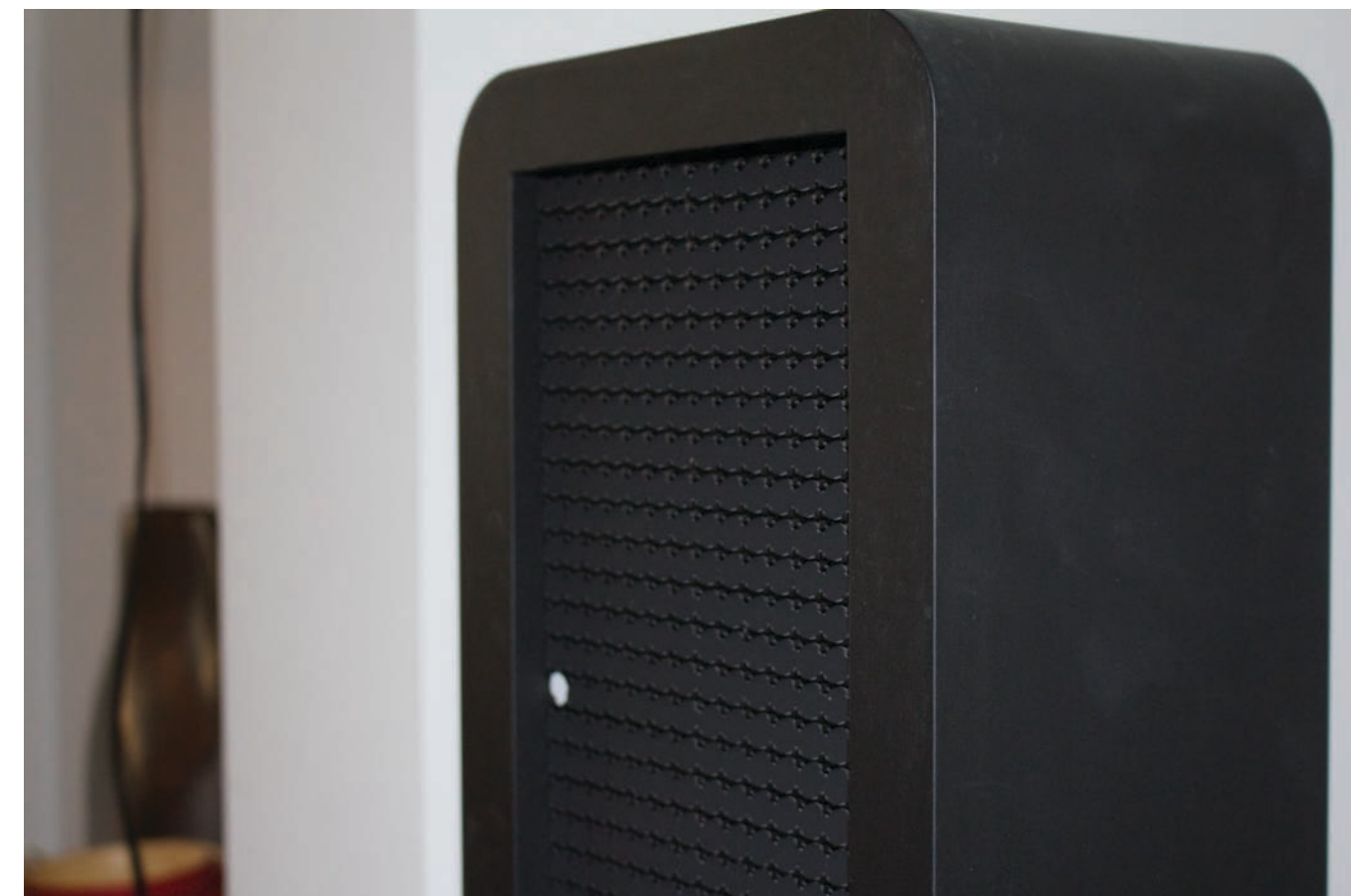
Ritual Machine 2: Anticipation of time together

This Ritual Machine allows this couple to recreate their ritual by drinking together whilst being apart. It poses questions about activities people enjoy together and whether these rituals can be maintained when separated. Can the Ritual Machine maintain the spontaneous nature of this family custom? Or does the spatial distance mean we are really drinking alone?