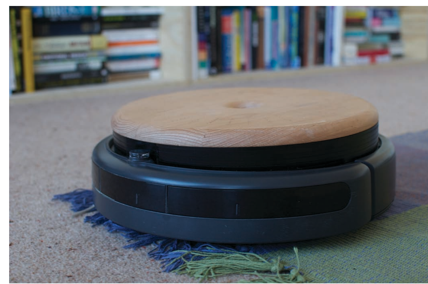
Ritual Machine 3: Connecting through chores

The couple in this family live together in London, but are regularly separated due to work trips. They often take a holiday together, travelling outside of the UK. Looking forward to these trips of reuniting, the anticipation of being together again and going on holiday, became the focus for the design of this Ritual Machine. This mechanical flip-dot display echoes a travel departure board. Our ethnographic interviews and probes revealed a specific aesthetic, and therefore the design of this Ritual Machine would need to meet the families design preferences. Inspired partly by the aesthetics and kinetic tension in flip boards from airport and train stations, where there is a build up of expectation induced by the mechanical movement of the letters, this Ritual Machine alludes to the sense of excitement associated with travel. The anticipation for the mechanical cascading of the dots is analogue to the anticipation of the next trip or time together.