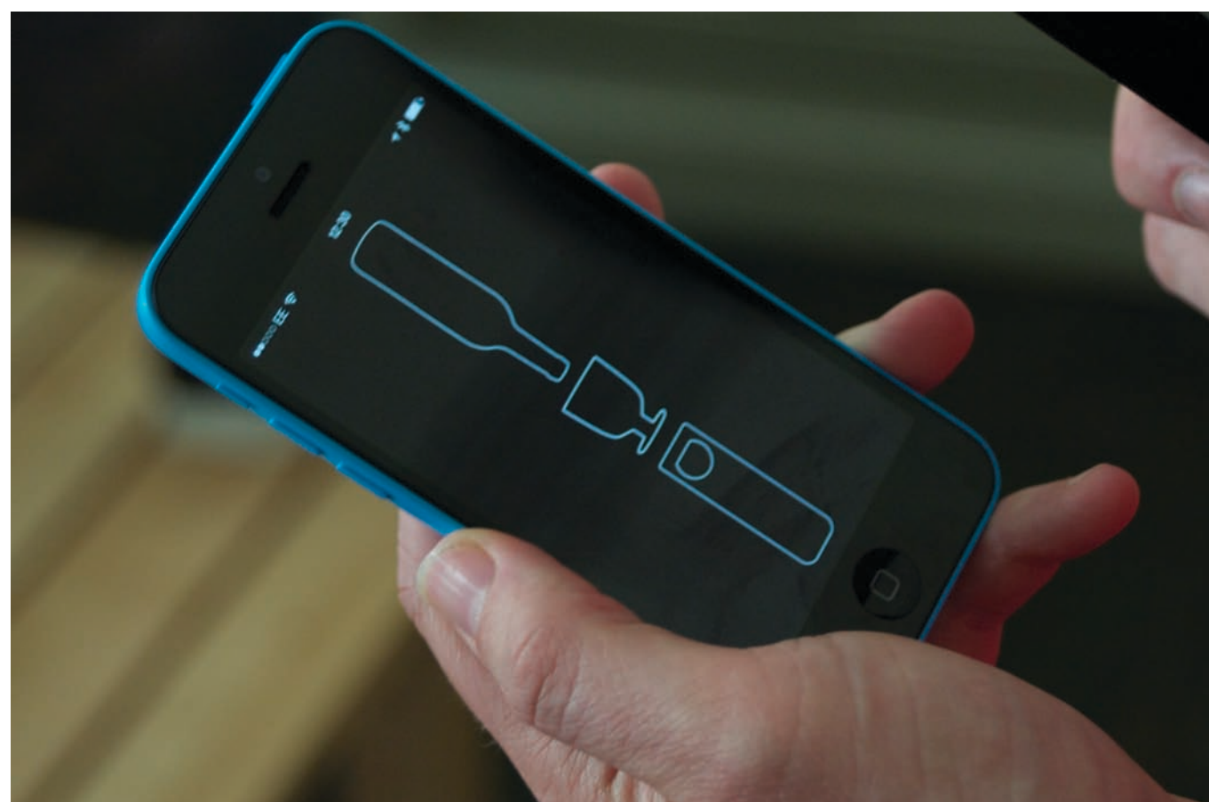
Ritual Machine 1: Drinking together whilst apart