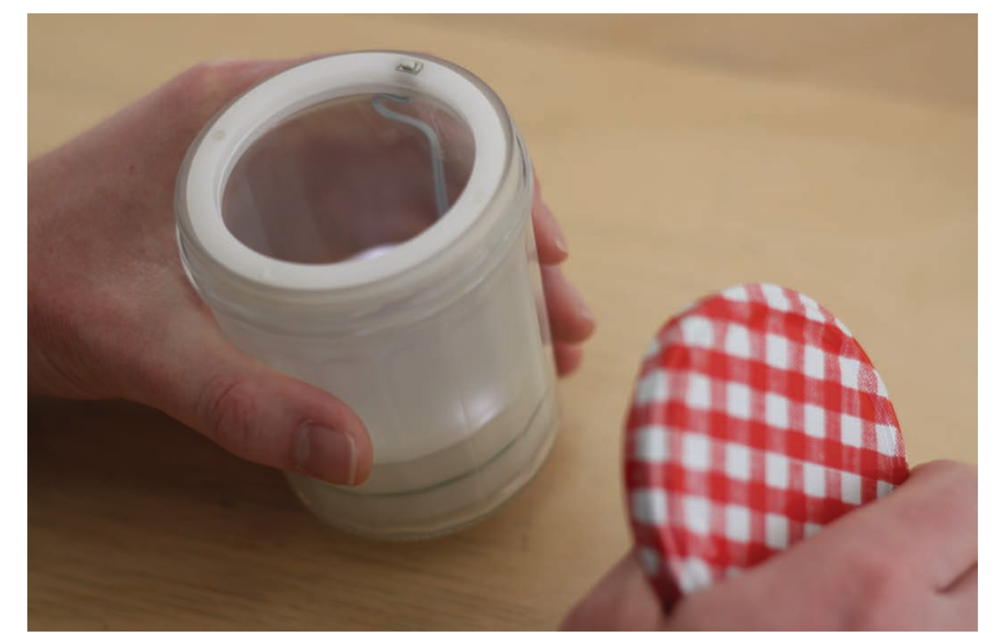
Ritual Machine 4: A message for the moment

The family use Skype on a daily basis to keep in touch but the children told us how they miss their father when he's away. They commented that when their father is home he does the domestic chores such as cleaning and vacuuming the home, and that they miss him when he is away as they have to help their mother more with these activities. The ritual of the father coming home and commencing cleaning, was the main impetus for this Ritual Machine. This Ritual Machine transforms the father's movements when in the UK into the movements of the robot vacuum cleaner in Sweden. Through the activities of the robot; his family in Sweden can recognise some of his routines while he is away.