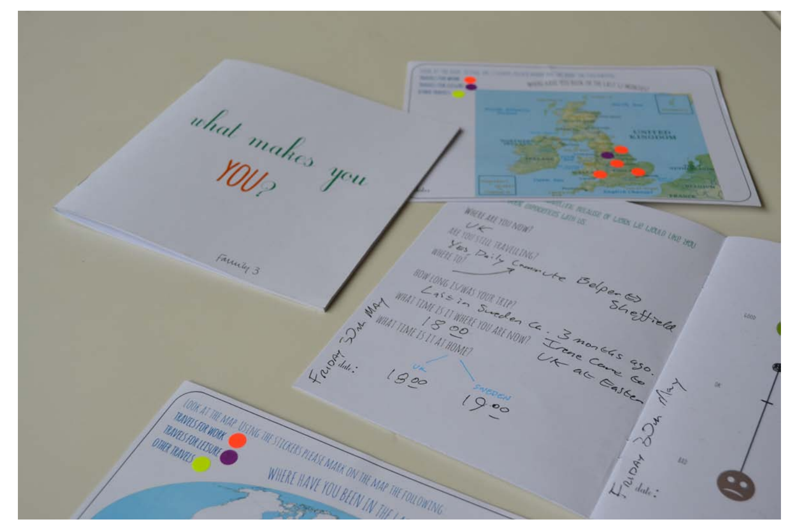
Gathering information from five families who experience regular separation due to work travel