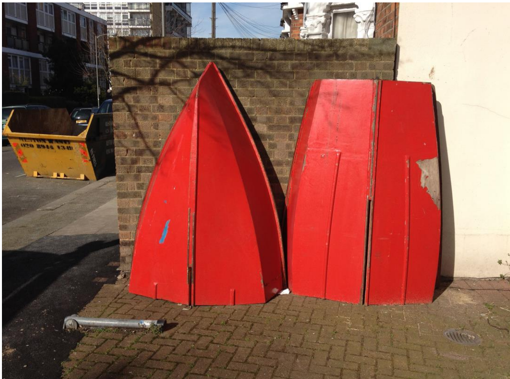
Bisected boat , London, 2016