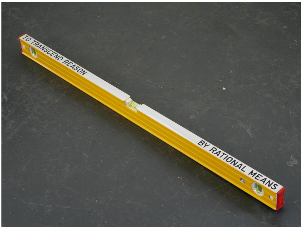
Tim O'Riley, Speculative Object (#10) , 2011 (sign paint, spirit level, length 101 cm)

The quest for the sublime in the everydayness of things—and the irony of this quest within a modern, technological world—is tinged with melancholy perhaps owing to the futility of this search or the exponential growth in attempts to record the transience of experience via (social) media. Between the fact of the image and the fact itself—the world—exists a space perhaps characterised by loss. Attempts to subjugate the image by text, for example, by locating it within the parentheses of metadata will likely be unending. Great strides have been made in image recognition but the dominance of text over image in terms of the former's 'search-ability' perhaps points to the practical issues involved, as we inhabit a system that is dominantly constituted through the logic embodied by text. But enmeshed as it is in a net of description, the image still resists. Just as the cloud in the sky invites one to become lost in speculation, the image can conflate perception and reverie.