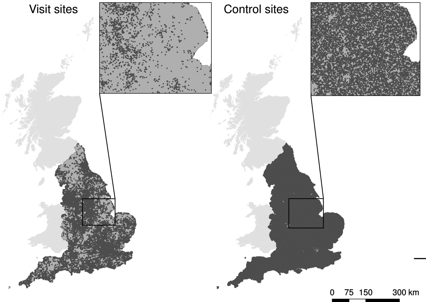
Fig 1. Distribution within England of visit and control points used in this study.