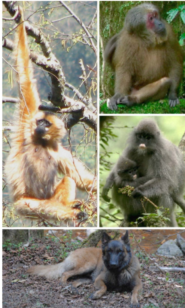
Figure 1. Clockwise from top left: western black crested gibbon ( Nomascus concolor ), stump-tailed macaque ( Macaca arctoides ), Indochinese gray langur ( Trachypithecus crepusculus ), and Pinkerton, the scat-detection dog.