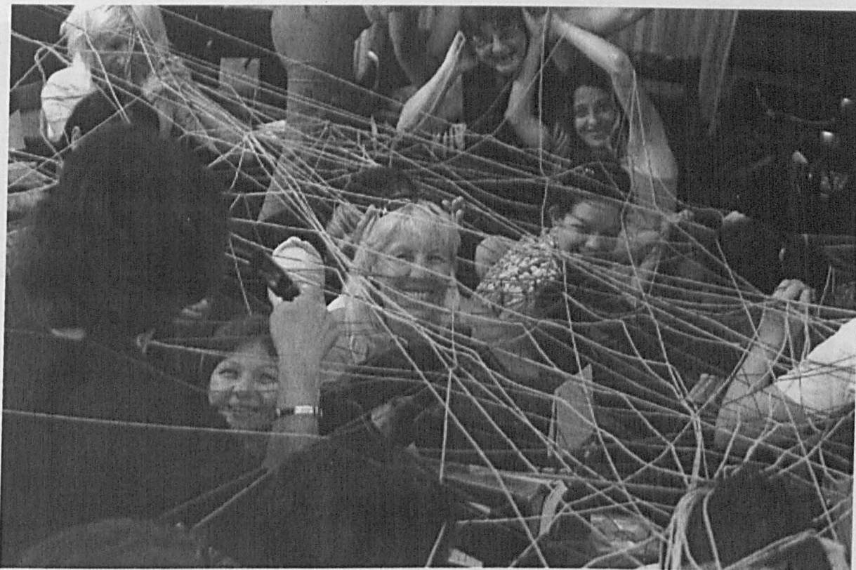
Image 3.2: Members of the Women in Black Network at a network meeting held in Kukaviča, near Leskovac June 5 – 7 th 2009. The final activity at this meeting saw participants form a circle to weave a web with brightly-coloured balls of wool. The web symbolised the way that activists are connected through shared values and how the web (or network) is dependant upon all of them working together. Photograph taken by Biliana Bibi Rakočević, 7 June 2009.

Image 3.2) depicts activists concerned with feminist-pacifism and domestic violence participating in an International Women's Day parade in Belgrade in March 2010: indicative of the overlaps in group membership and interests.