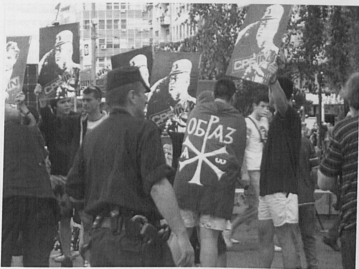
Image 3.1: July 10 2009. Members of Obraz protesting during a Women in Black memorial service held on the 14 th anniversary of the massacre at Srebrenica, Eastern Bosnia-Herzegovina. Abuse was directed at Women in Black activists, who were called 'liars' and 'witches' for condemning the crimes committed at Srebrenica.