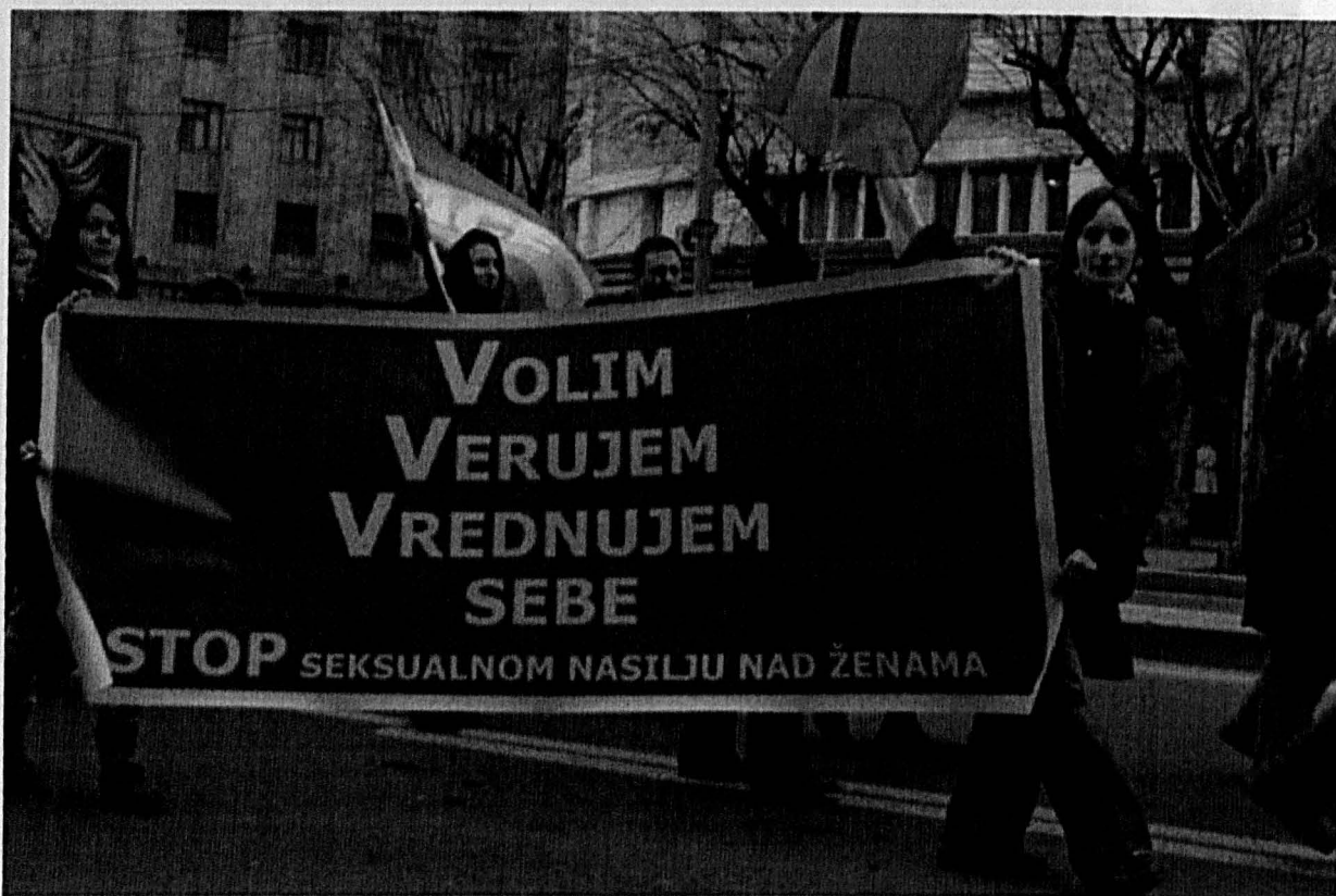
Image 3.3: Photograph taken during an International Women's Day parade, Belgrade, March 8 2010, where activists from a wide range of groups gathered together. Behind the red banner "I love, believe in and value myself: STOP sexual violence against women" held by activists primarily concerned with domestic violence issues, the rainbow flags held by feminist peace activists can be seen. This is typical of the overlaps and networks that exist within Serbian feminist and women's organising. Photograph taken by Biliana Bibi Rakočević, 8 March 2010.

political positions in relation to the wars and attitudes towards feminism. Frequently, work is carried out in relation to specific issues or objectives relating to domestic violence – for example: coordinating social support services for victims of violence, training police officers in how to deal with domestic violence calls, or proposals for legal changes to the Criminal Code of Serbia – by bringing together a relevant group of actors and activists.