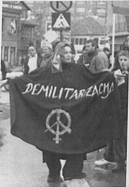
Image 5.1: Women in Black activist holding a banner marked demilitarizacija (antimilitarisation) during a protest.

overview can be reached from their publicised perspectives. 6 The group has articulated their collective vision of feminist-pacifism through publications, workshops, seminars and street actions. 7 One reason for the wide range of perspectives is that the Women in Black network is an association of several groups and individuals dotted around Serbia. The national network has its origins in the Belgrade group, and so other feminist-pacifist groups around Serbia are connected to Women in Black – Belgrade. When “Women in Black” is mentioned in this chapter, it refers to the network of groups and activists that form the Women in Black network in Serbia, even if the particular group is not named “Women in Black”.