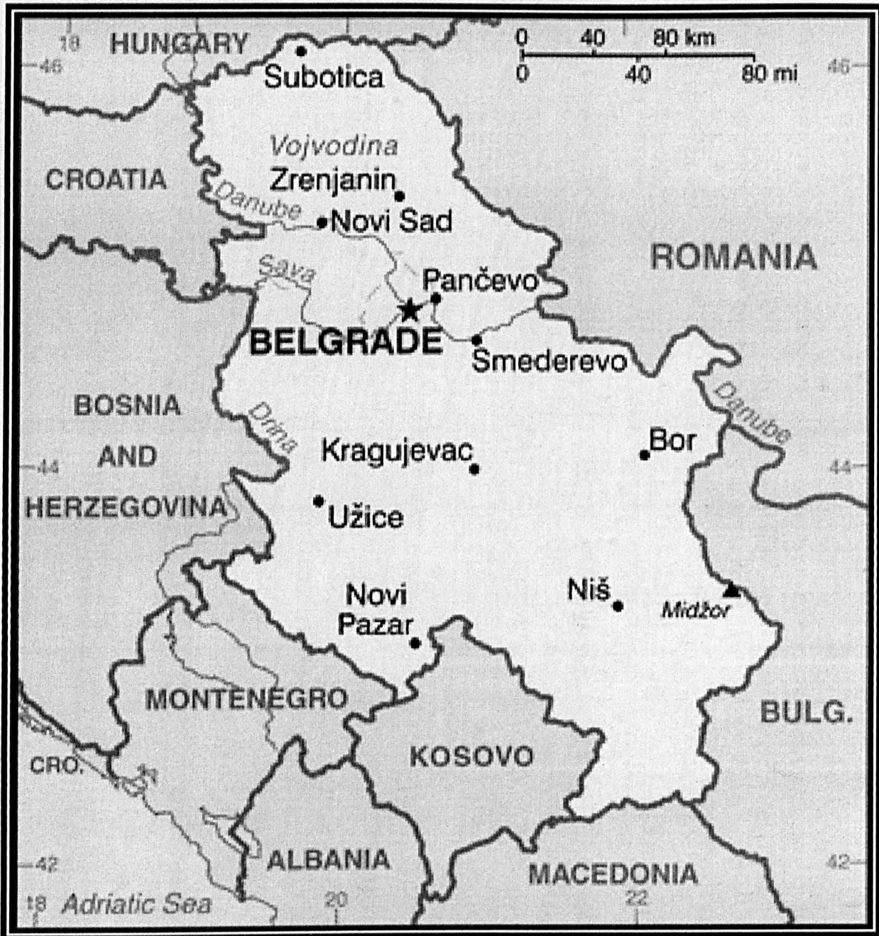
Map of Serbia: retrieved from http://www.balkanology.com/serbia/ [accessed 11 March 2010].