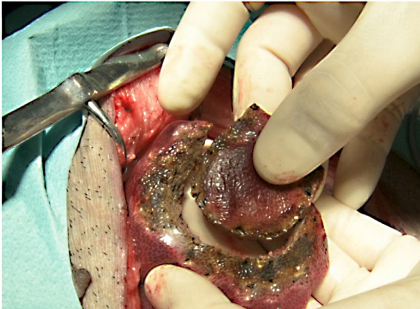
Fig. 2. View of the liver tissue after coagulation and surgical excision