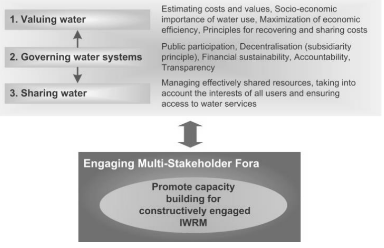
Figure 1: The INECO Framework and Goals

Each challenge suggests different and complementary issues that need to be addressed within a water management system, so as to achieve long-term sustainability without compromising the well-being of all user groups. These challenges and their relevance to the Mediterranean context formed the backbone of the project's Case Studies; they further motivated efforts towards the constructive engagement of stakeholders in the different areas for discussing implications of alternative or complementary institutional and economic responses for water stress mitigation (Fig. 1).