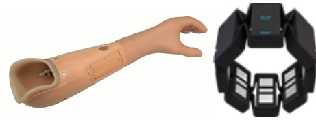
Figure 1. (Left) A myoelectric upper limb prosthesis – myo. (Right) The Thalmic Labs Myo Armband – Myoband.

Myoelectric signals are electrical impulses that occur naturally as we contract our muscles. Myoelectrically-controlled powered prosthetic devices (or myos) read muscle signals (using electromyographic sensors – EMG) from residual muscle tissue, and use them as control for motion [28,29]. The simplest myos open and close based on the presence of inner- and outer-forearm muscle activity (known as flexion and extension, respectively). However, many other control schemes exist and can work in combination, including proportional (adjusting the speed of motion proportionally with the intensity of muscle contractions), mode-switching (to enable selection between different types of movement), and pattern recognition techniques (for more natural control mappings) [17,33]. In this study, we focus