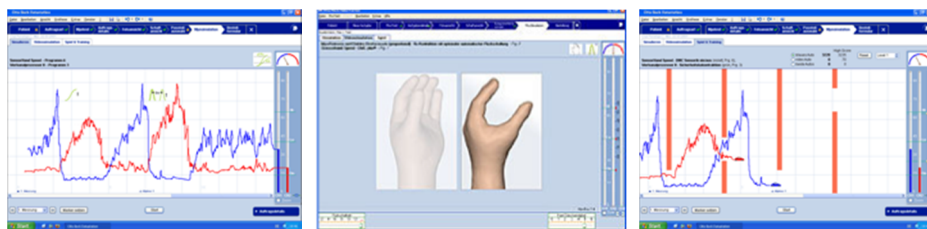
Figure 2: Ottobock PAULA training suite (raw muscle activity, prosthetic hand simulator, and car game, left to right)

Our initial game design was based on requirements gathered through conversations with Linda, in addition to a