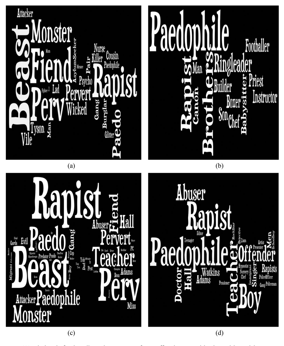
Figure 1. Word clouds for headline descriptors of sex offenders in tabloids and broadsheets. Note: Word clouds for (a) tabloid descriptors in 2012, (b) broadsheet descriptors in 2012, (c) tabloid descriptors in 2013, and (d) broadsheet descriptors in 2013.

Within the 2012 sample of articles about sexual crime, headline descriptors of perpetrators formed the basis of the main differences between tabloids and broadsheets on this topic (word clouds 'a' and 'b'; Figure 1). Tabloids were found to utilise more offensive headline descriptors about sexual offenders (e.g. 'beast', 'paedo', and 'monster') than broadsheets (e.g. 'man' and 'rapist'). This trend was broadly replicated within the 2013 headline descriptor data (word clouds 'c' and 'd'; Figure 1).