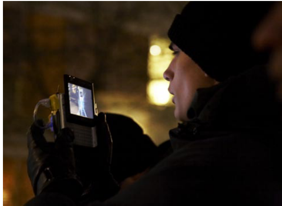
Figure 4. Interference: A player using the UMPC to map out the virtual network.

Additionally the sleek design of the UMPCs was seen as really fitting the setting of the initial game scenes. In some groups mapping out the network became a group effort with different players stating their opinion on where to go next, while in other groups one person with good orientation skills took the lead.