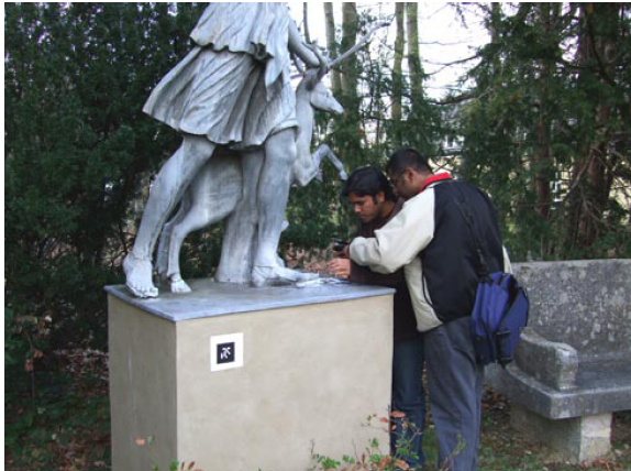
Figure 5. The Treasure: Two players getting a new quest from a statue.

At this point we gave them an overview of the Magic Lens Box, and let them ponder about the best way to implement their game. In the beginning the students had some problems understanding the difference between mobile and stationary containers . After getting examples, however, on how to use them best, the students quickly noticed that all the characters in the game (real statues) were best represented by stationary containers , while the items the players would have to use for solving the riddles became mobile containers (as these would be carried around by the players).