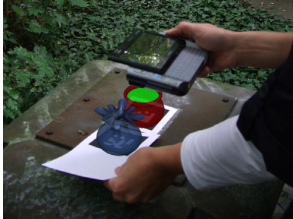
Figure 3. The Alchemists: A player puts an ingredient from the bag into the cauldron by using the basic interaction of the Magic Lens Box.

Especially the scoring process demanded that you could attach a rule to several game objects at the same time, something we had overlooked in the first design process for the Magic Lens Box and quickly implemented. It also proved very useful that instead of having to specify a concrete game object or property inside a condition or action of a rule , you could always instead automatically use the game object or property that invoked the rule .