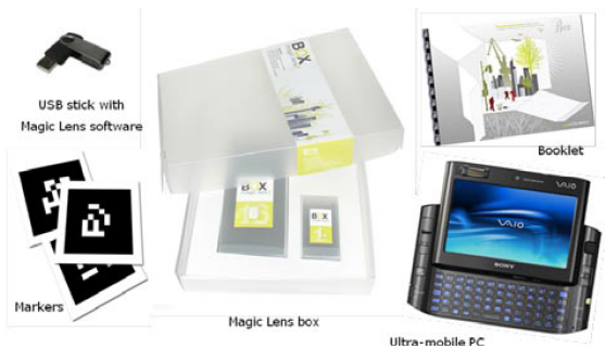
Figure 1. The Magic Lens Box (center) and its content (left and right)

Our two main objectives are somehow contradictory, since supporting a high flexibility in the design makes a system rather more complex and does not simplify it. To achieve the objectives stated above we had to cut down and limit certain aspects. During the iterative design we decided on a certain MR hardware system as well as on a certain set of interaction techniques that are the same for all the games based on the Magic Lens Box.