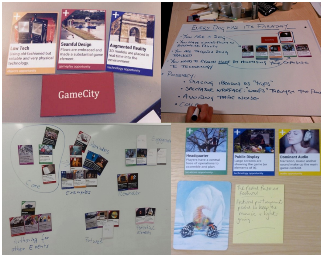
Figure 3: Inspiration for Restickulous (top left); poster from study 2.1 (top right); finished game from study 2.2 (bottom left); game idea from study 2.3 (bottom right)

Concerning the two variants for idea generation we received seemingly mixed feedback. One group clearly preferred variant 1. Their argument was similar to what we observed during the previous iterations: “Somebody played SOCIAL CONTRACT, and somebody else said ‘Oh, I think USER-CREATED CONTENT really fits nicely to that’.” Another group